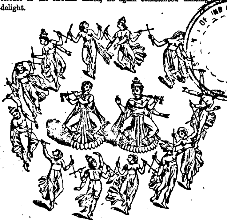
Rás Mandala, or Circular Dance.

As many cowherdesses as there were, just so many bodies did the divine Krishn Chand assume, and, taking all with him to that same terrace of the circular dance, he again commenced dancing with delight.