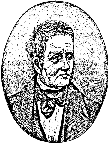
Thomas de Quincey

cey." The French form of the name was adopted by the son after his researches had satisfied him that the family was descended from a Norman who "came over with the Conqueror."