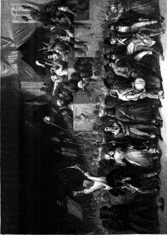
London. Published by Richard Bentley & Son, 1895. The Freedom Song