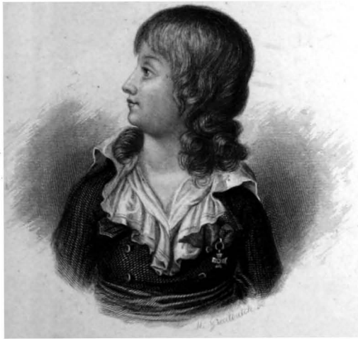
LOUIS THE SEVENTEENTH.