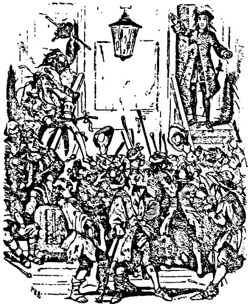
LORD GEORGE BRINGS NEWS OF THE DEBATE