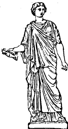
The Muse Clio.