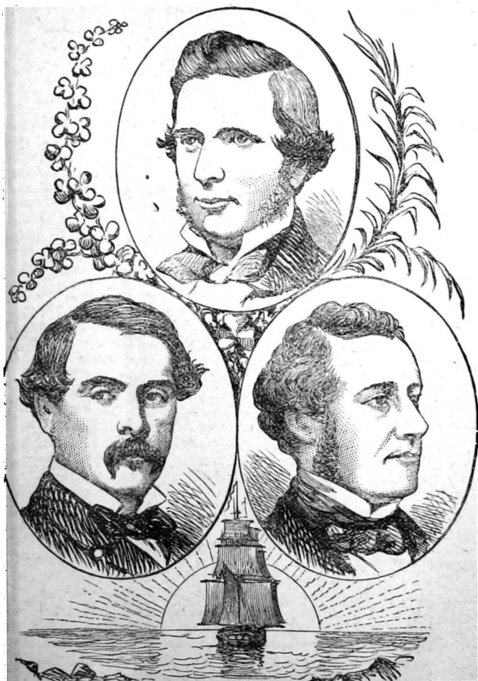
KEVIN I. O'DOHERTY. THOMAS F. MEAGHER. TERENCE B. M'MANUS.