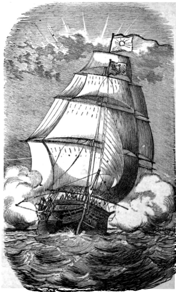
The "Erin's Hope" Saluting the Green Flag.