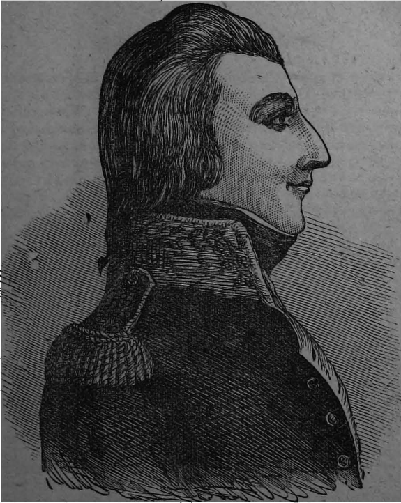
THEOBALD WOLFE TONE.