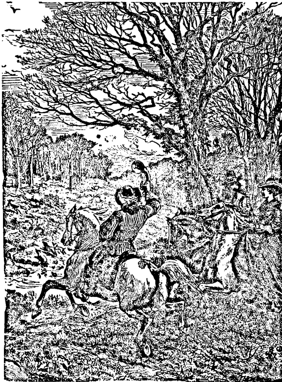
HUNTING THE DEER.

"He rusheth out and through the brakes doth drive, As though up by the roots the bushes he would rise."