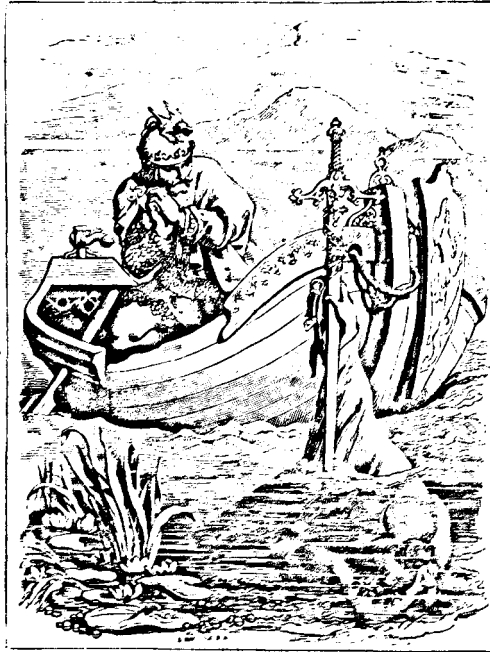
KING ARTHUR'S DEATH.

"A hand and arm did meet the sword, And flourished three times in the air; Then sunk beneath the running stream, And of the duke was seen nae mair."