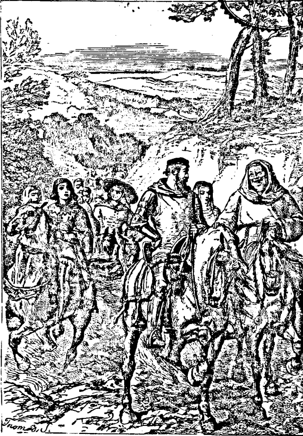
THE CANTERBURY PILGRIMS.

"A monk there was afayre for the maistrie ; An outrider that loved veterie ; A manly man to ben an abbot able."