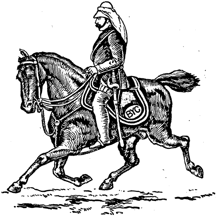
THE BENGAL YEOMANRY CAVALRY (VOLUNTEERS) IN THE INDIAN MUTINY CAMPAIGN, 1857-58.