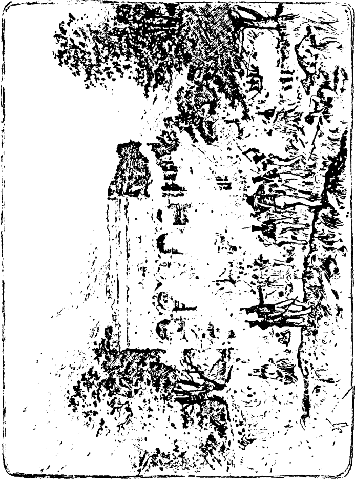
THE HOUSE AT A'BAH.