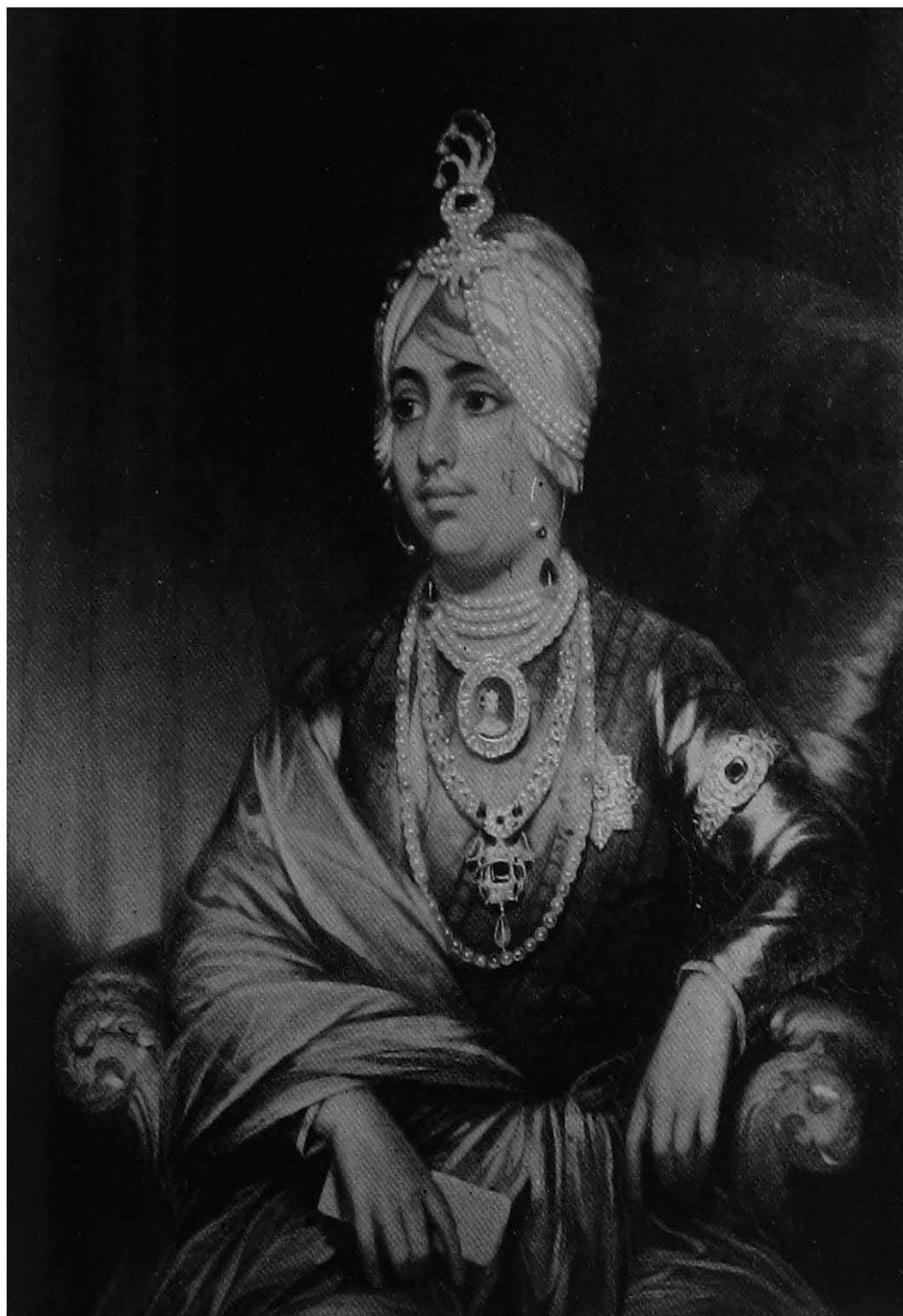
MAHARAJAH DULEEP SINGH.