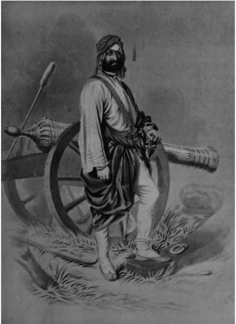
RAJAH SHERE SINGH.