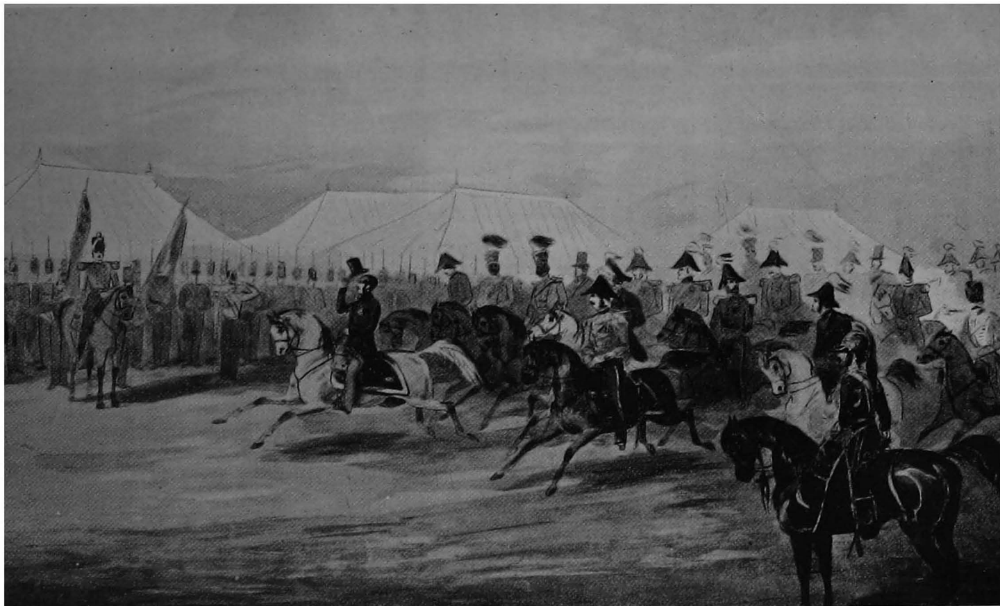
THE MARQUESS OF DALHOUSIE ON "MAHARAJAH" ENTERING CAMP AT CAWNPORE, 1852.