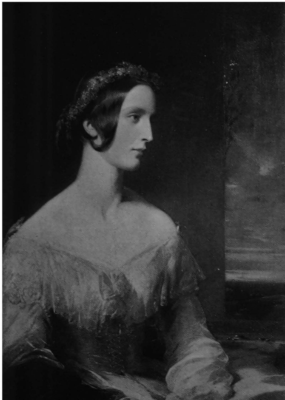
THE MARCHIONESS OF DALHOUSIE.