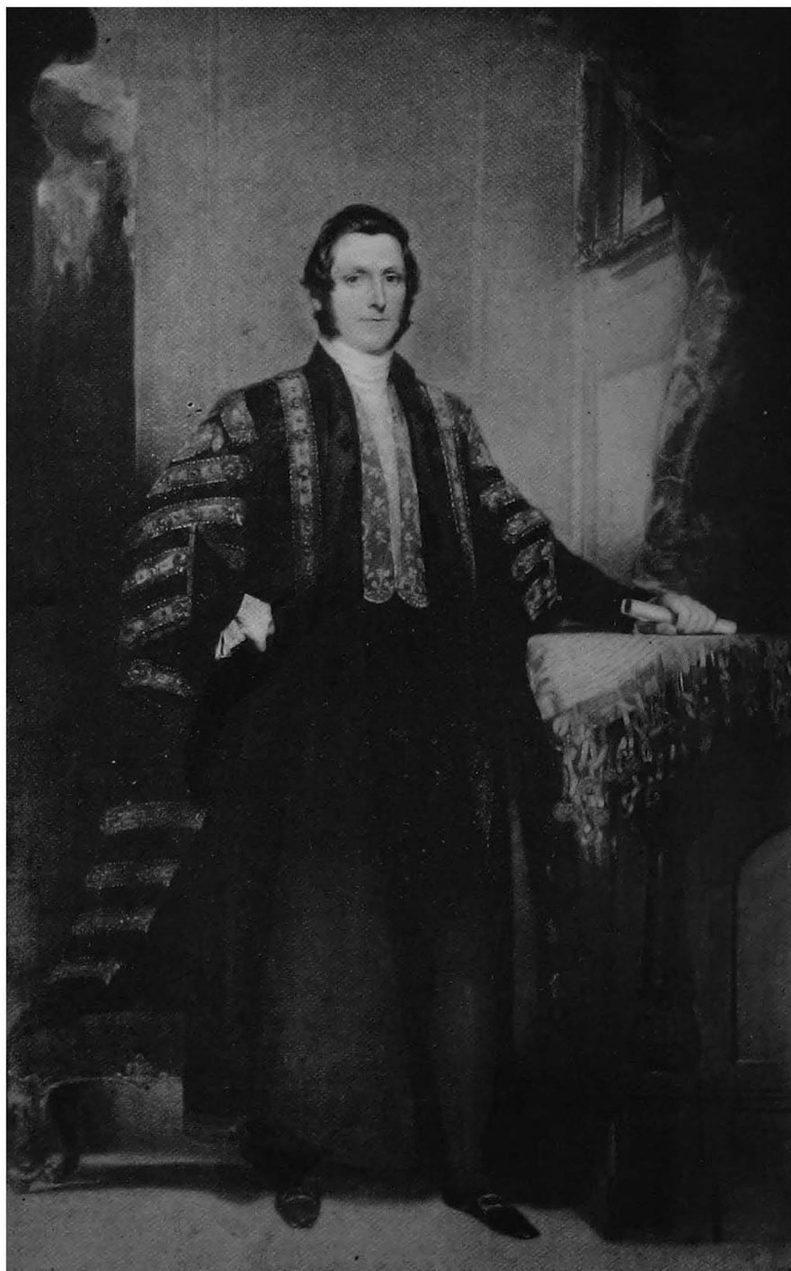
THE MARQUESS OF DALHOUSIE, K.T. (From a Painting by Sir J. Watson Gordon, R.A., 1847.)