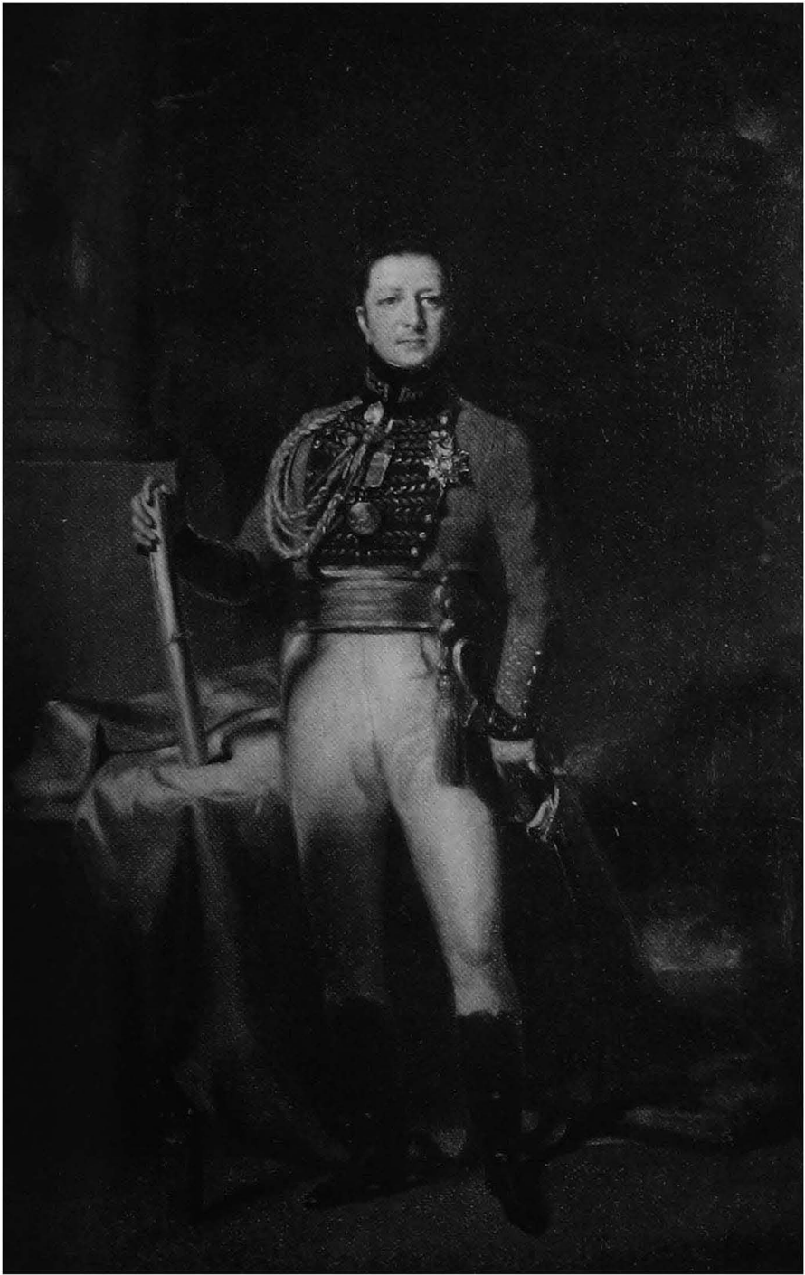
GENERAL THE EARL OF DALHOUSIE, G.C.B.

(From a Painting by Sir J. Watson Gordon, R.A.)