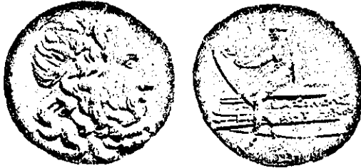
FIG. 22.—ANTIGONOS DÔSON.

year 283 B.C. His reign extended to forty-four years. His brother Antigonos Dôson reigned afterwards over Macedonia for