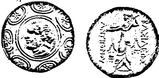
FIG. 21.—ANTIGONOS GONATAS.

ANTIGONOS GONATAS was one of the kings to whom Asôka