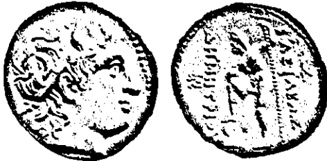
FIG. 24.—DÈMÈTRIOS POLIORKÈTÈS.

DÈMÈTRIOS POLIORKÈTÈS, the son of Antigonos, became king of Macedonia in 294 B.C.