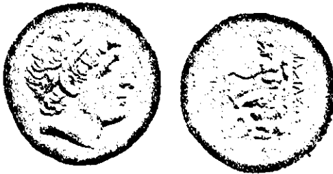
FIG. 23.—ANTIOCHOS II.

ANTIOCHOS II., surnamed Theos, succeeded to the throne of Syria on the death of his father Antiochos I., who was the son of the famous Seleukos Nikator. During many years of his reign he was engaged in intermittent hostilities with Ptolemy Philadelphos the king of Egypt, who wrested from him Phœnicia and Hollow Syria. His power was further weakened by the revolt of