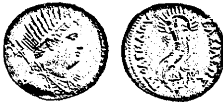
FIG. 25.—PTOLEMY III.

PTOLEMY III. ascended the throne of Egypt in 247 B.C. in succession to his father Ptolemy Philadelphos. In the early part of his reign he overran Syria, and having thence turned his arms