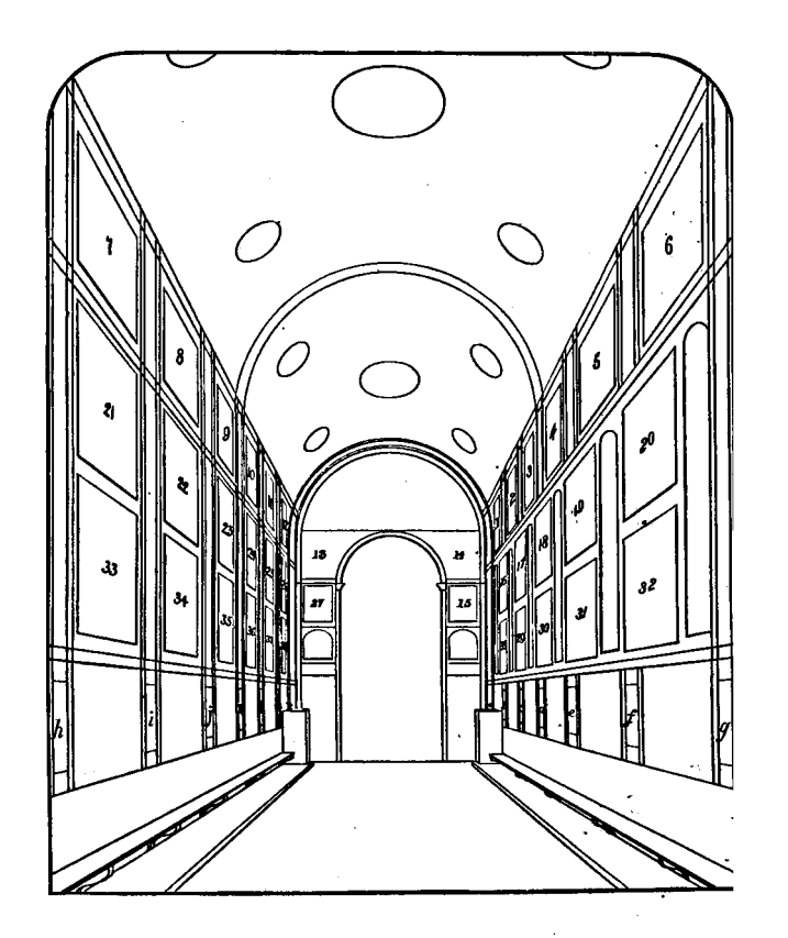
INTERIOR OF THE ARENA CHAPEL, PADUA, LOOKING BASTWARD.