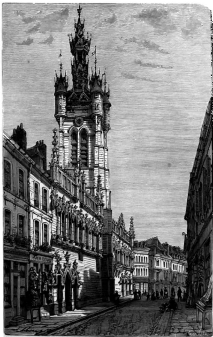
THE BELFRY AT DOUAL.