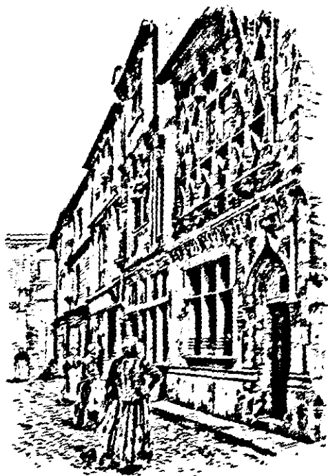
LE MANS. THE HOUSE OF QUEEN BÉRENGÈRE.