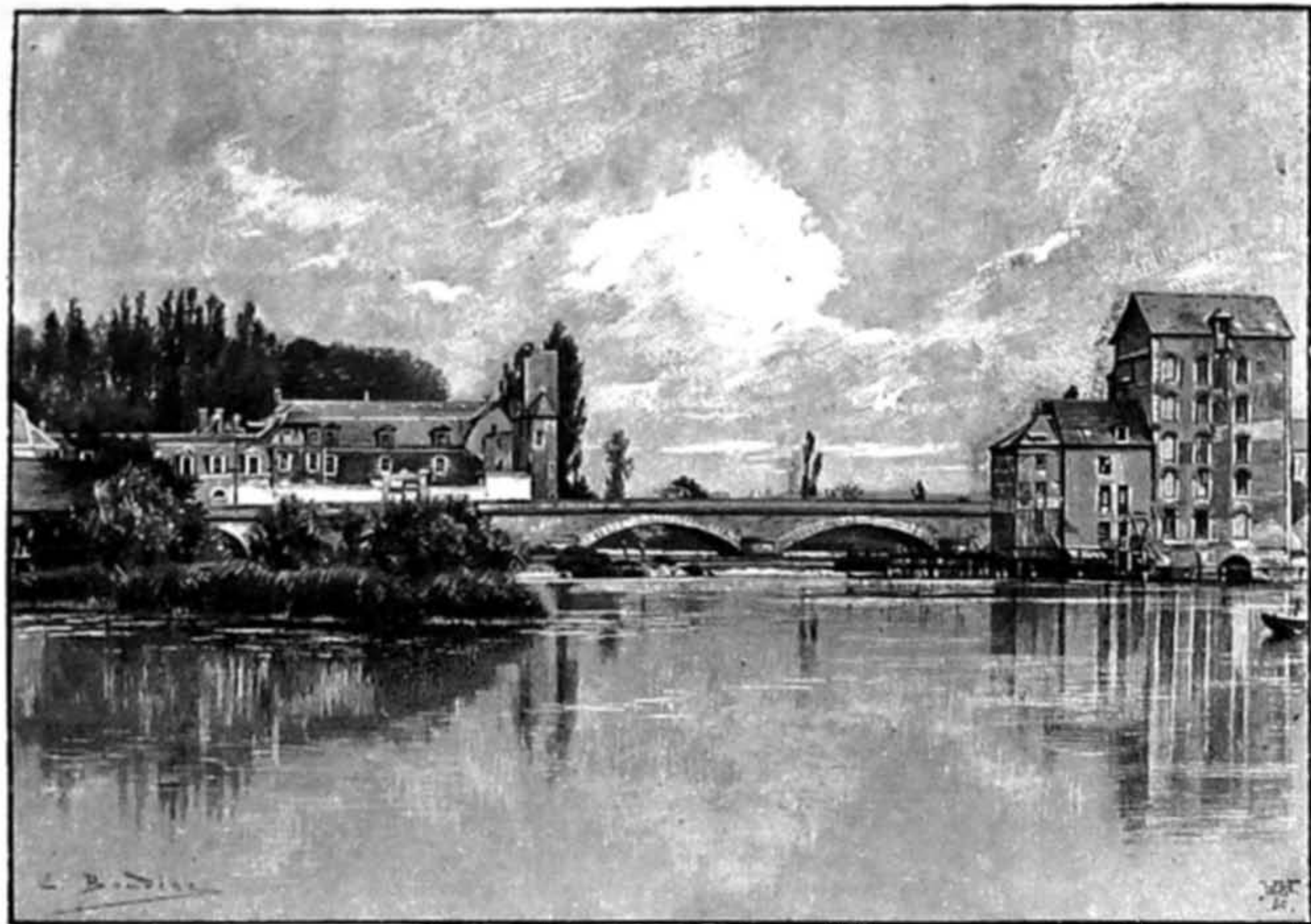
LA FLÈCHE ON THE LOIR.