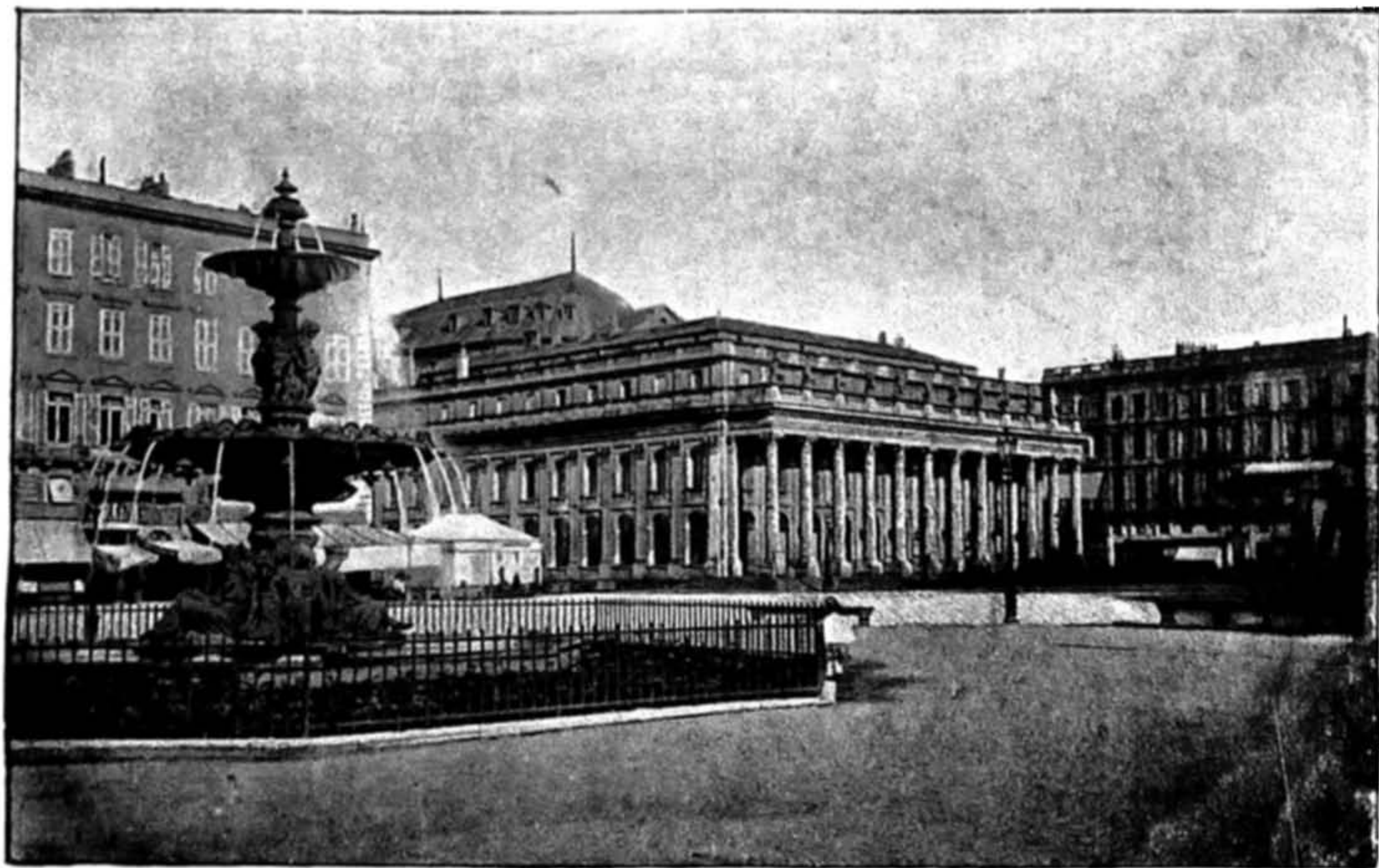
THEATRE AT BORDEAUX.