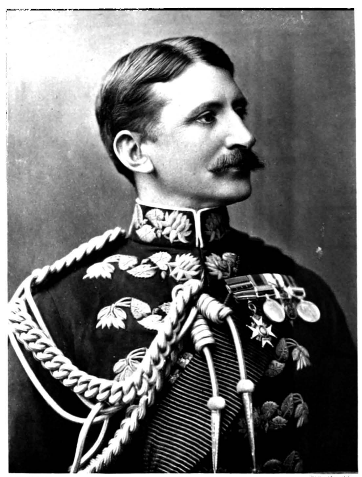
lowell Simla photo