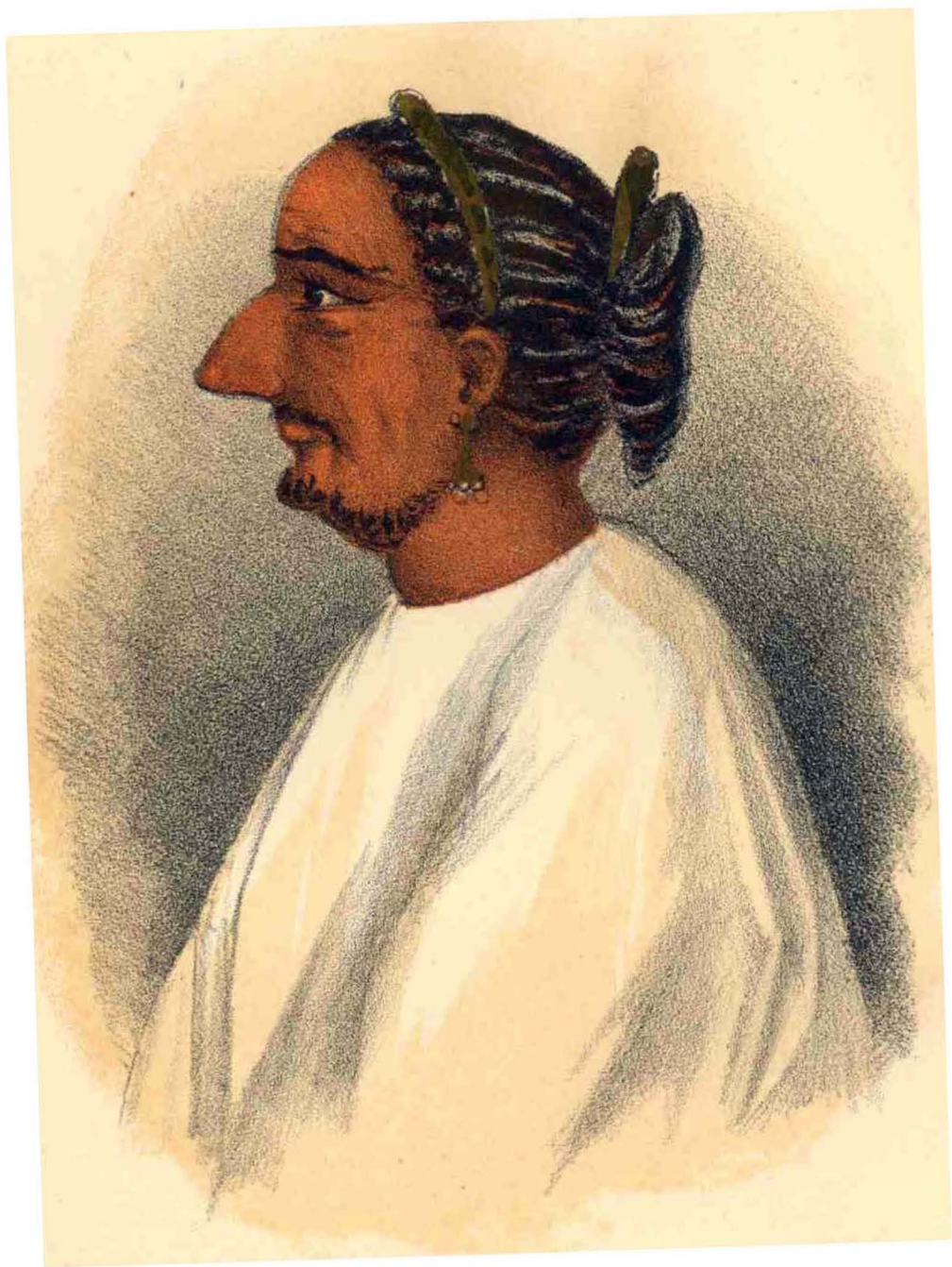
A CINGHALESE GENTLEMAN.