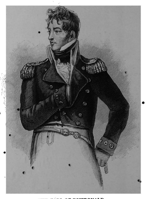
THE EARL OF DUNDONALD After the Picture by Stroehling