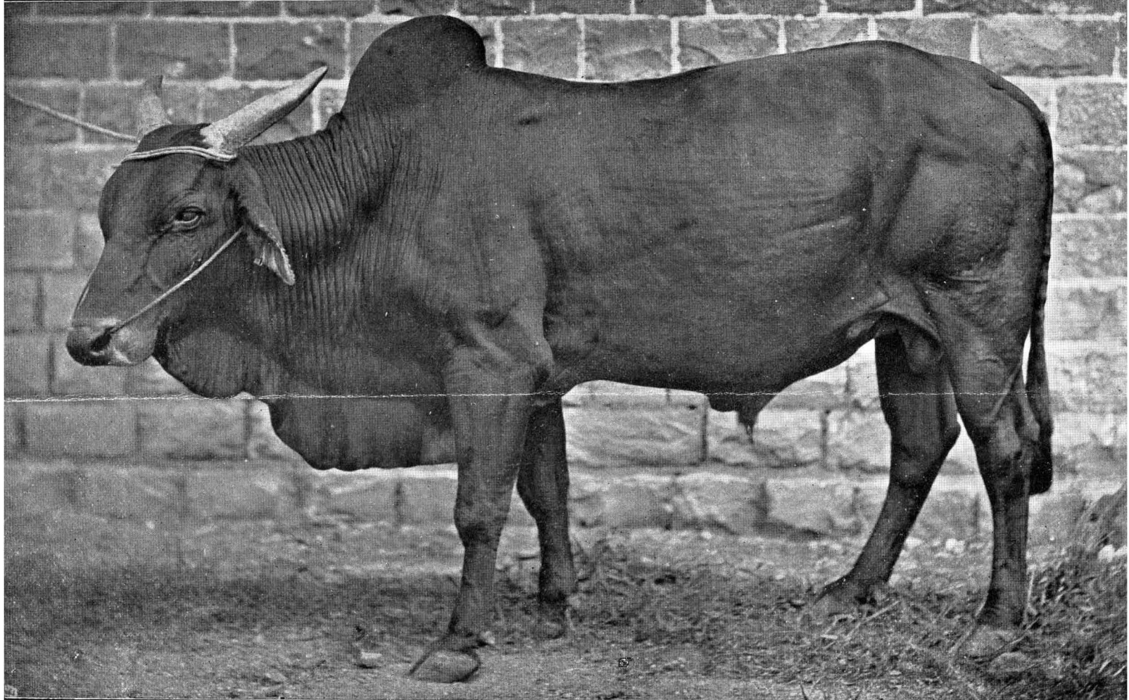
DECCANI BULL—Seven years old—not castrated.