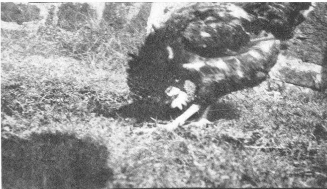
Figure 2. Choreia in a Fowl, following an attack of Infectious Laryngotracheitis.