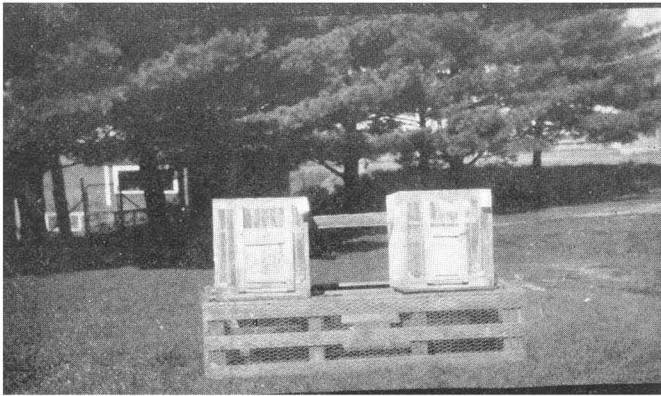
Figure 1. Wire Cages Connected by Runway—used for the mouse and sparrow experiments.