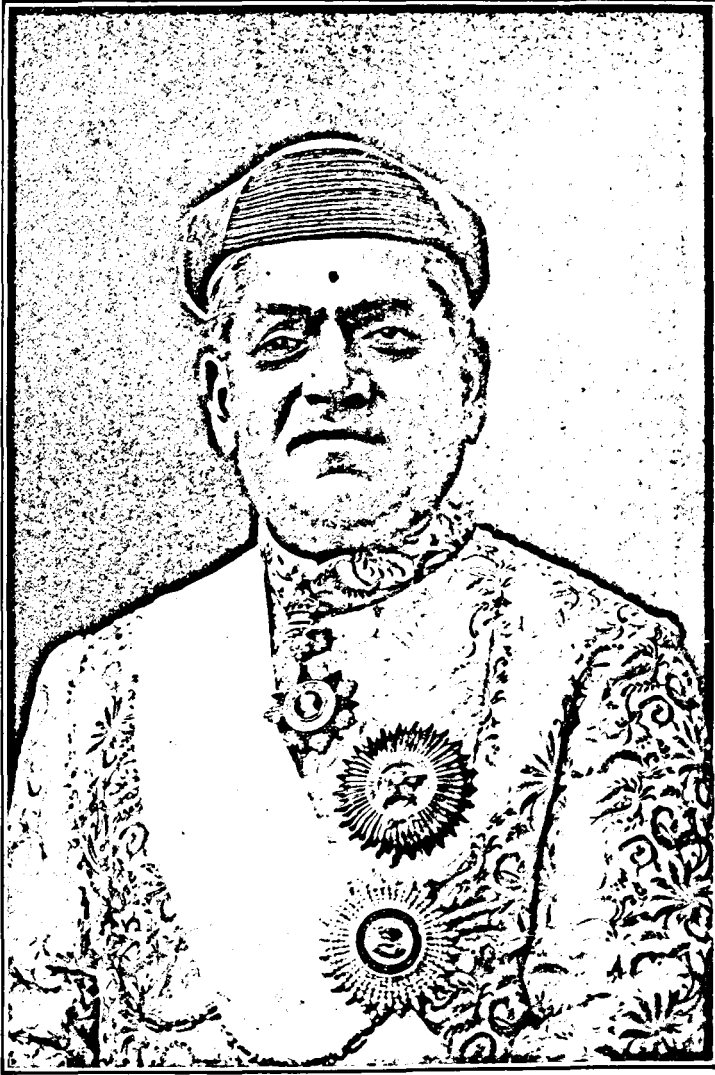
H. H. Maharaja Sayajirao Gackwad of Baroda, "Sena-Khas Khel, Samsher Bahadur, Farzand-i-Khas-i-Dowlat-i-Inglishie, G.C.S.I., G.C.I.E., LL. D.