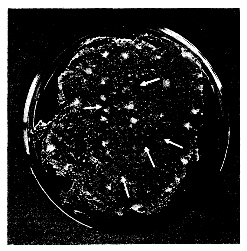
Fig. 1. Plate showing Ps. putrefaciens in areas heavily overgrown with other species; the plate of special gelatin agar was smeared directly with rotted wood from a churn.

beef infusion agar but was obtained from a number by smearing on beef infusion agar after enrichment in litmus milk or in experimental butter at approximately 5°C. Since this medium and enrichment temperature are not particularly satisfactory for isolating Ps. putrefaciens , the organism probably was in various samples from which it was not recovered. The more recent studies, in which serum from putrid butter was smeared on the special gelatin agar and also was added to litmus milk for enrichment at 3°C., have recovered Ps. putrefaciens from many samples of typically putrid salted butter. In some cases the organism was isolated directly, but usually enrichment was necessary.