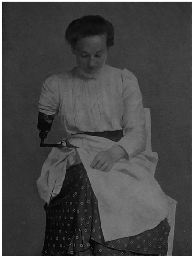
APPARATUS FOR SEWING.