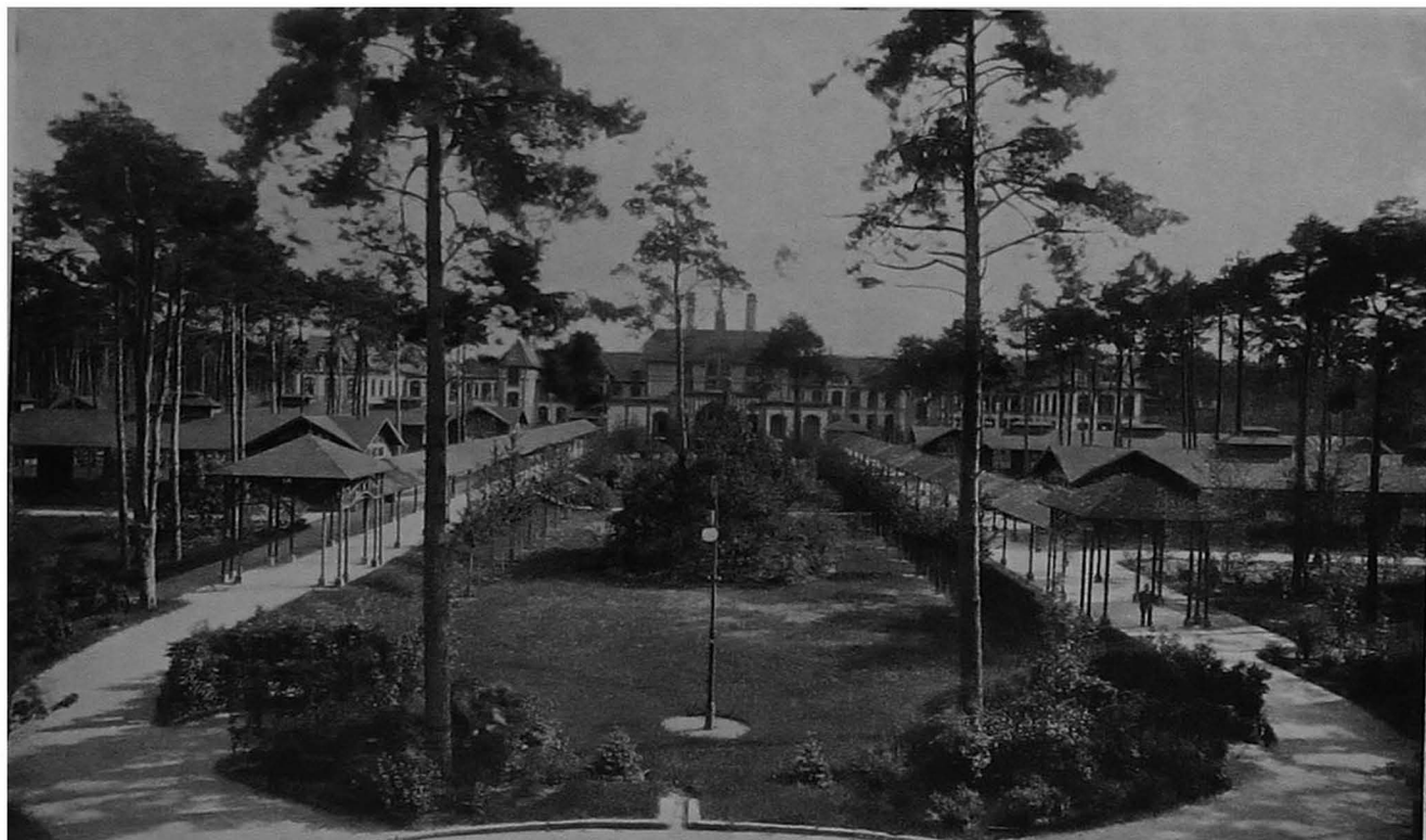
BEELITZ SANATORIUM (BELONGING TO THE BERLIN PENSION BOARD)—PAVILIONS, SHELTERS, AND PROMENADES.