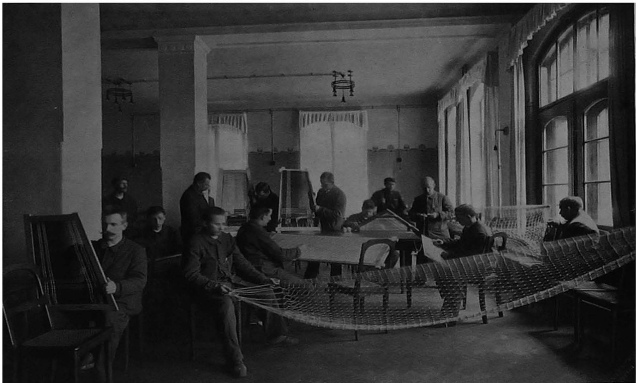
BEEELITZ SANATORIUM (BELONGING TO THE BERLIN PENSION BOARD)—A WORKROOM.