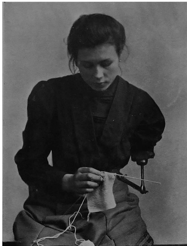
APPARATUS FOR KNITTING.