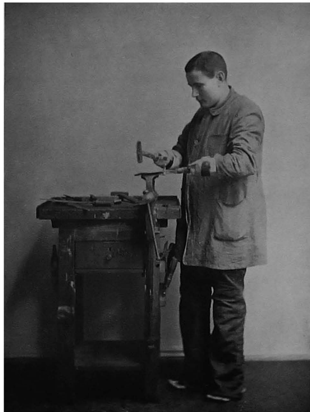
II.—THE SAME IN THE WORKSHOP.