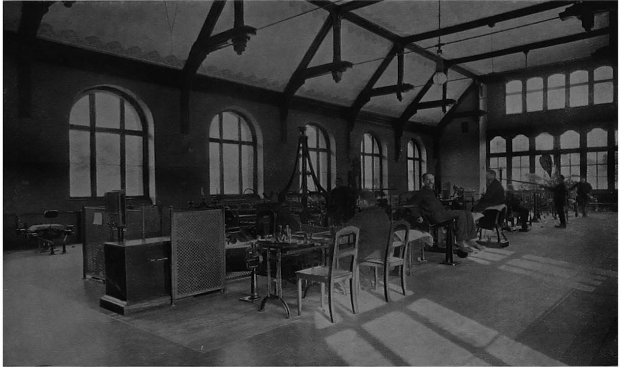
BEEELITZ SANATORIUM (BELONGING TO THE BERLIN PENSION BOARD)—ZANDER HALL FOR MEDICO-MECHANICAL APPARATUS.