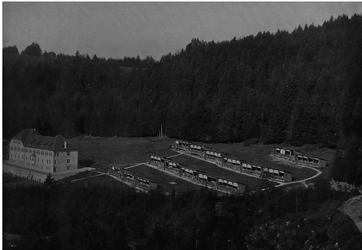
UEBERRUH SANATORIUM FOR CONSUMPTIVES (BELONGING TO THE WÜRTEMBERG PENSION BOARD)— GENERAL VIEW, WITH SHELTERS.