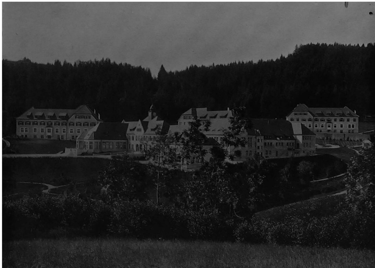
UEBERRUH SANATORIUM FOR CONSUMPTIVES (BELONGING TO THE WÜRTEMBERG PENSION BOARD)—