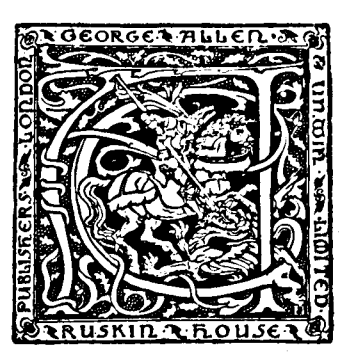
GEORGE ALLEN & UNWIN LTD. London: 40 Museum Street, W.C.I Cape Town: 73 St. George's Street Sydney, N.S.W.: Wynyard Square Wellington, N.Z.: 4 Willis Street