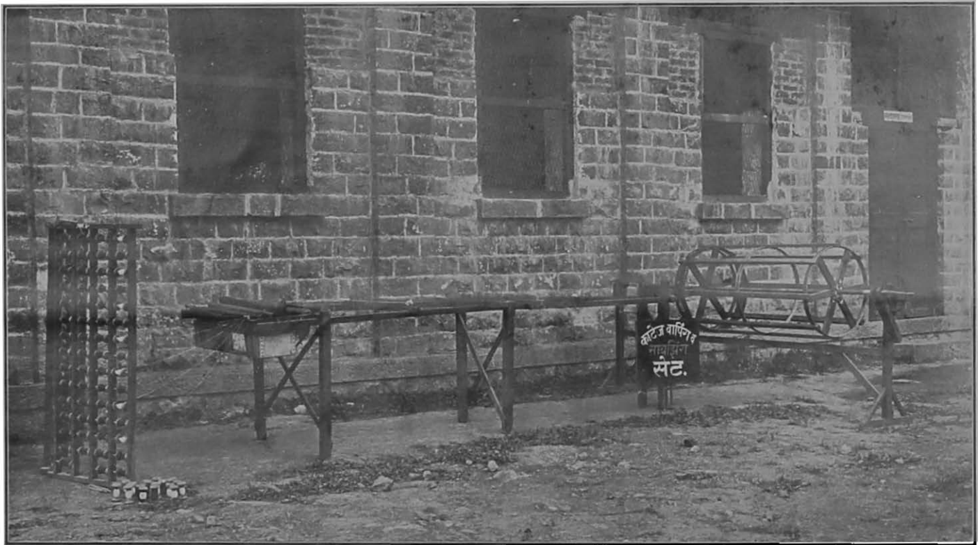
Cottage Hand Sizing and Warping Machine (suitable for an individual weaver).