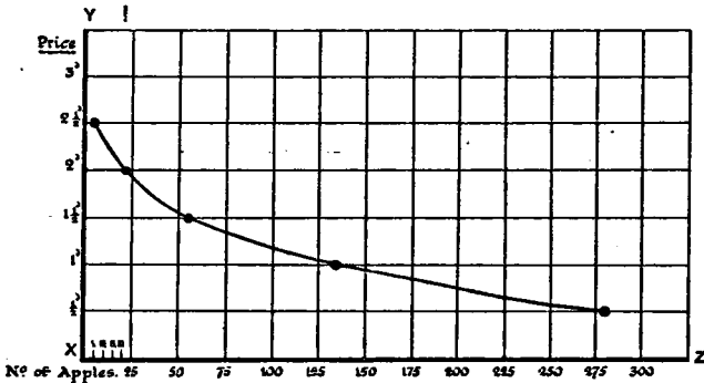
FIG. 2.—Illustrating the Demand Schedule of the Market as shown in Table B, p. 118.

diagram in which one line represents total utility and the other total price. The former rises rapidly at first, but soon tails off into a very flat curve, while the latter follows a straight line which finally cuts the total utility curve.