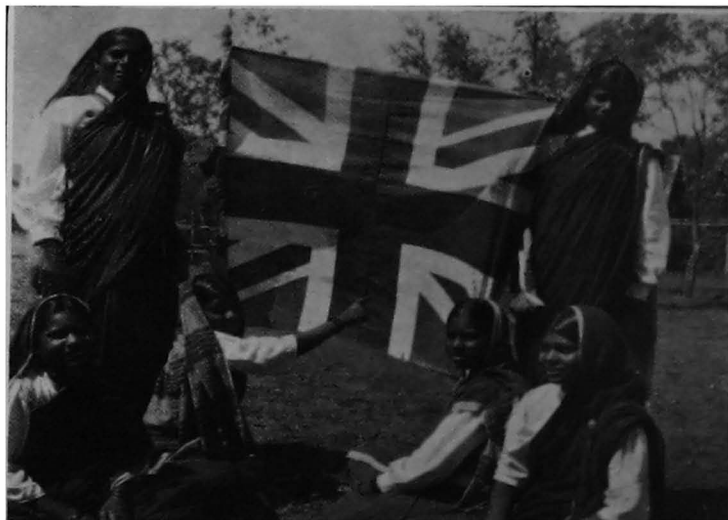
OUR GUIDES AT WORK