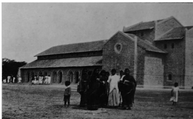
THE CHURCH OF THE HOLY NAME