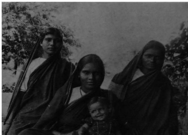
YOUNG CHRISTIANS FROM THE TRIBES