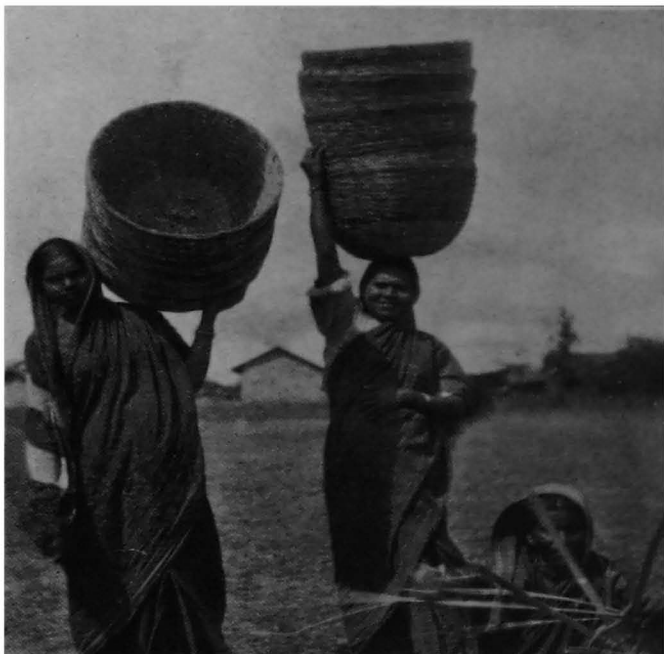
THE BASKET MAKERS