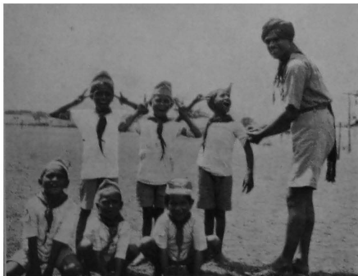
A FEW OF THE CUBS