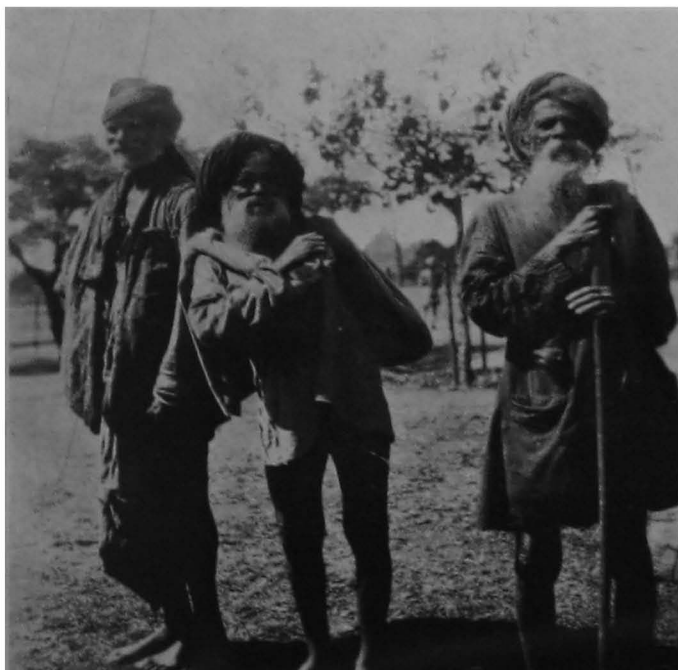
THREE OLD FRIENDS