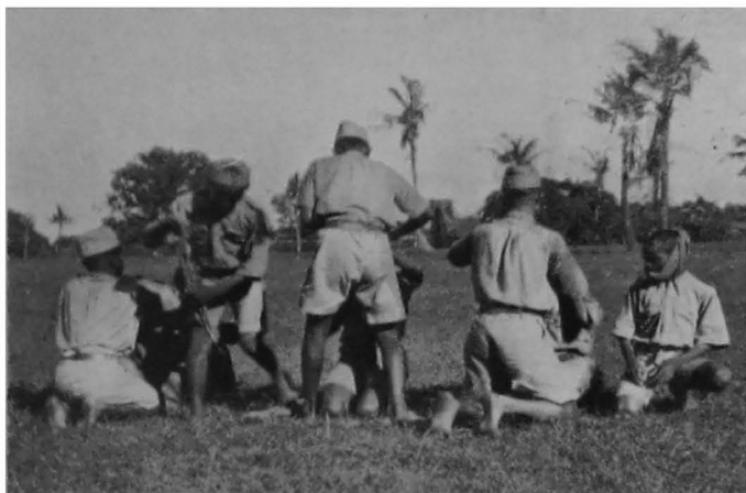
FIRST AID AT A SCOUT RALLY (The Hubli troop won a cup)