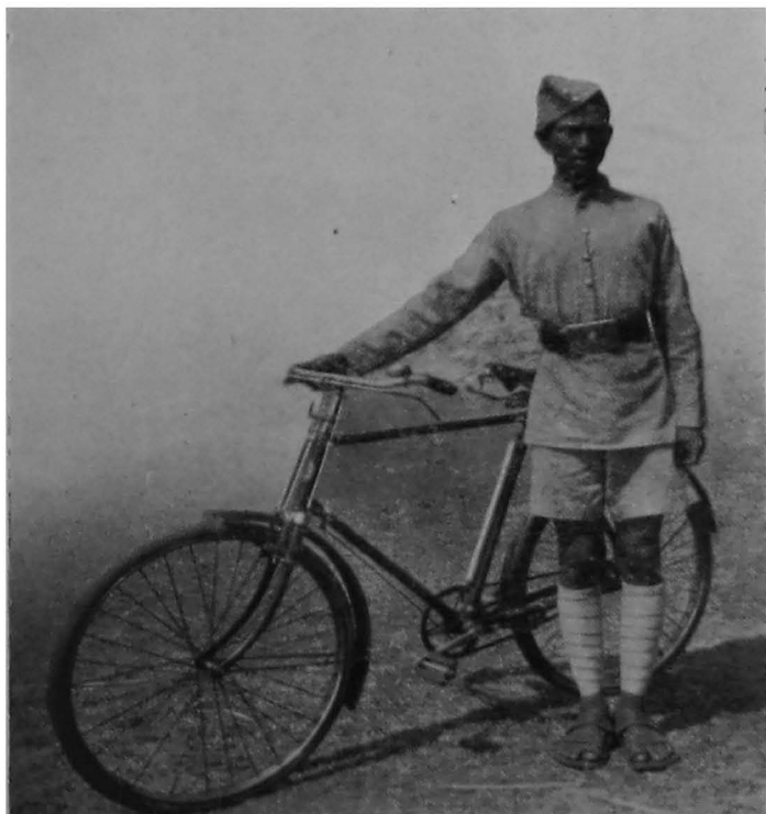
GABYA THE BHAT GUARD