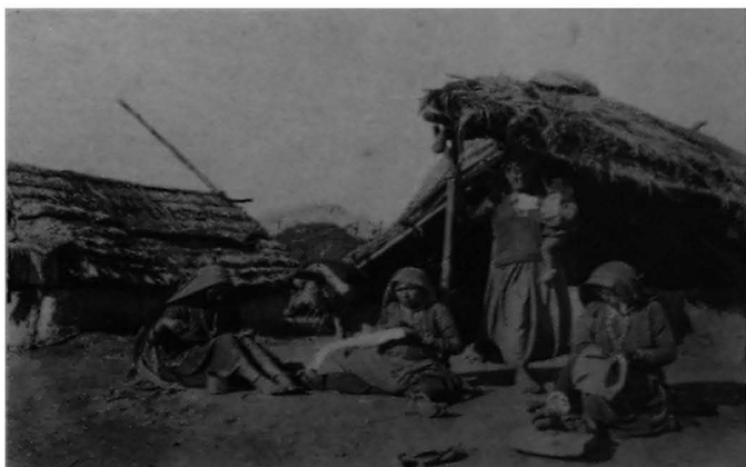
BHAT WOMEN DOING EMBROIDERY