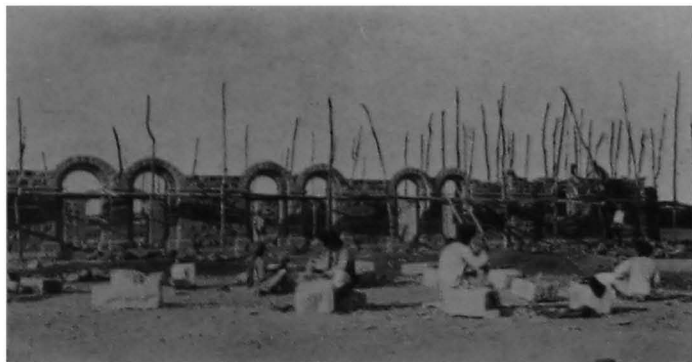
THE CHURCH OF THE HOLY NAME BEING BUILT