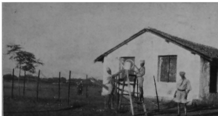
THE HOUSE THE SCOUTS BUILT