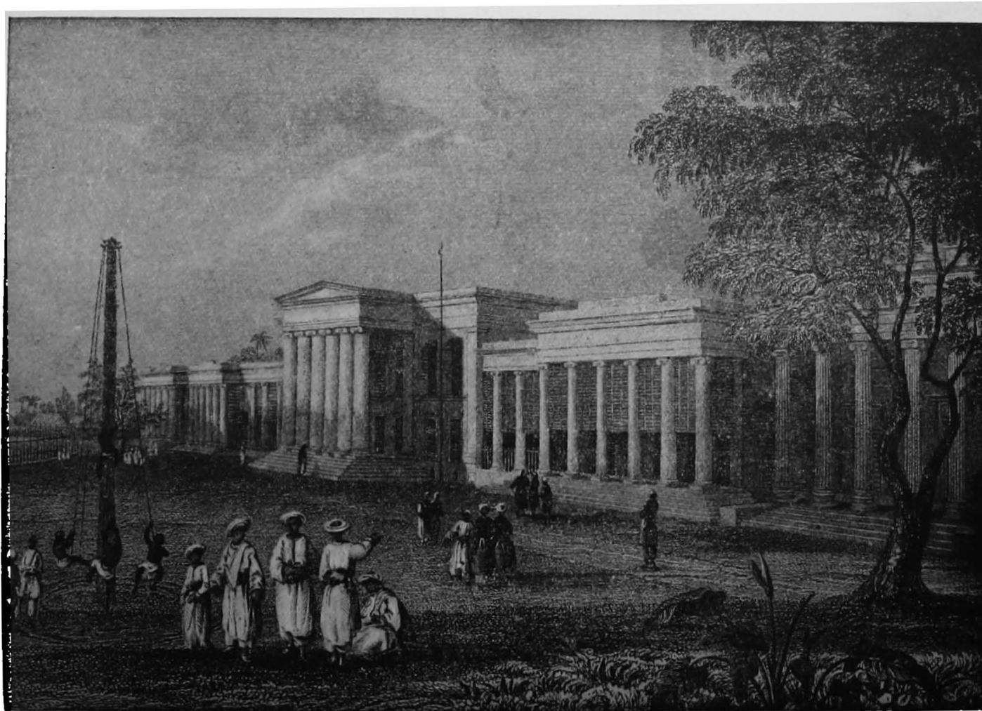
HINDU COLLEGE, CALCUTTA, 1847.