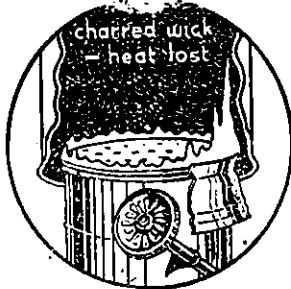
Laurel will not do this.

THE flame of your lamp or PERFECTION Stove cannot burn true with a charred wick. Heat is lost—the wick becomes uneven, and soon is useless. Avoid this by using Laurel. Laurel does not char the wick—it burns longest and brightest of all oils.