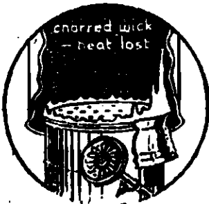
Laurel will not do this.

THE flame of your lamp or PERFECTION Stove cannot burn true with a charred wick. Heat is lost—the wick becomes uneven, and soon is useless. Avoid this by using Laurel. Laurel does not char the wick—it burns longest and brightest of all oils.