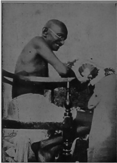
MAHATMA GANDHI as he is at present. મહાત્મા ગાંધીજી (હાલમાં)