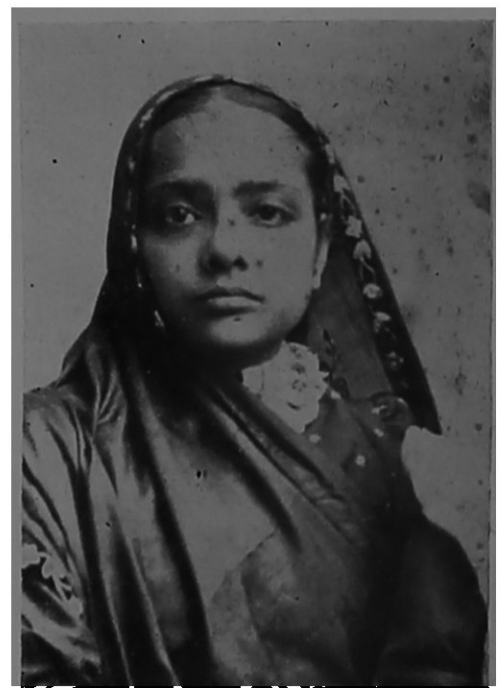
Mrs. M. K. GANDHI in 1897. પૂજ્ય કર્સ્તુરબા ૧૮૯૭ માં ૬. આ. માં હતા ત્યારે.