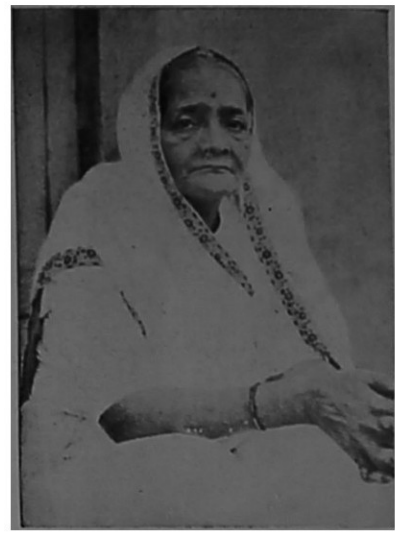
Mrs. GANDHI પૂજ્ય કર્સ્તુરબા