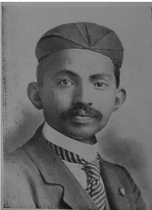
Mr. M. K. GANDHI when he was practising in 1902 in S. Africa. શ્રી. મોહનદાસ કરમચંદ ગાંધી સાથે આફ્રિકામાં પ્રેક્ટીસ કરતા હતા ત્યારે