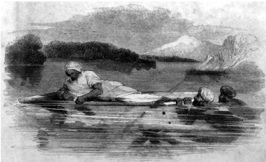
Method of crossing Rivers in the Panjab.

TOGETHER WITH CHARACTERISTIC ILLUSTRATIONS, AND A MAP OF THOSE COUNTRIES CONSTRUCTED BY MR. JOHN ARROWSMITH, FROM THE BEST AND MOST RECENT AUTHORITIES.