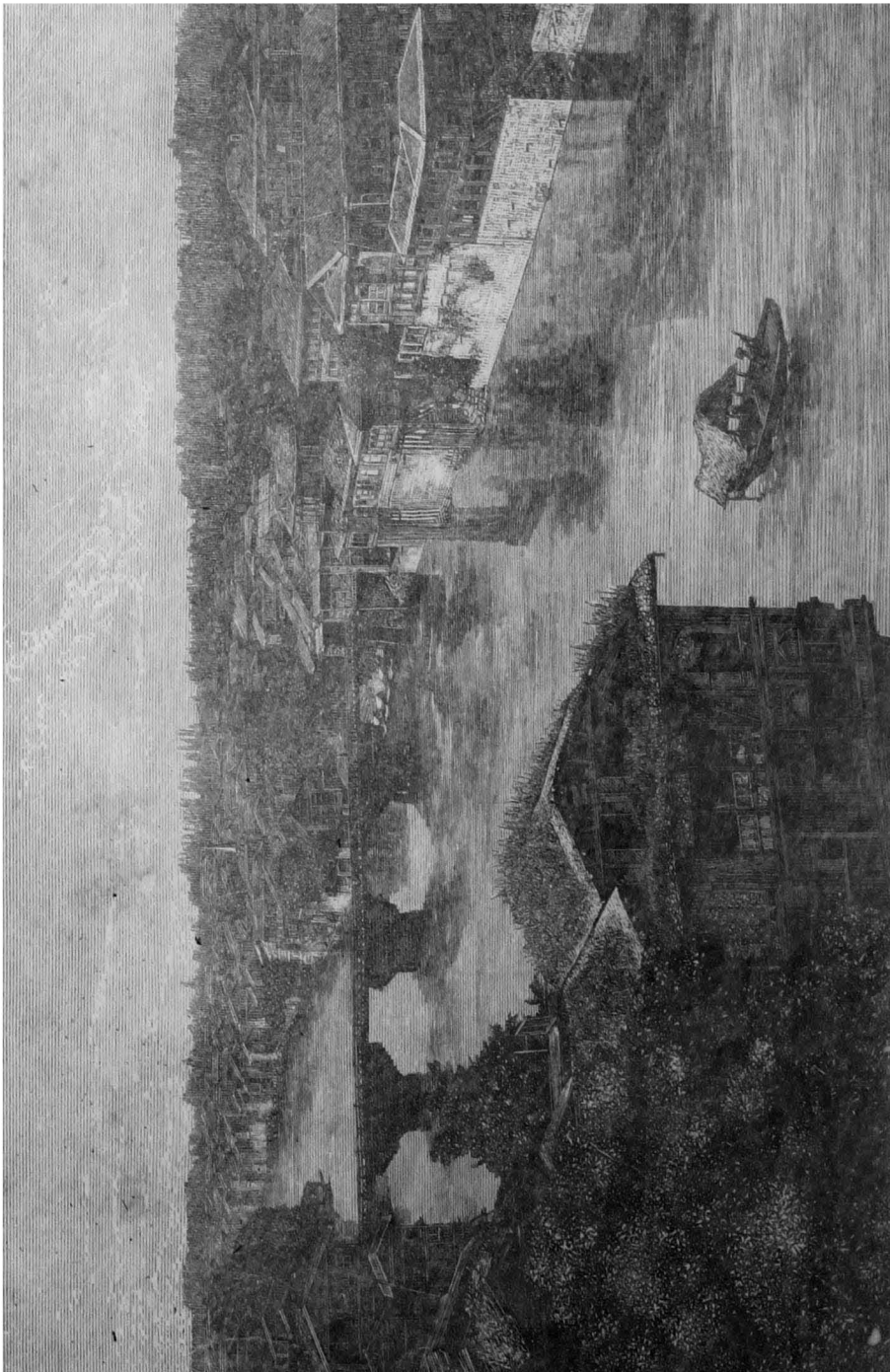
CITY OF SIRINAGAR.