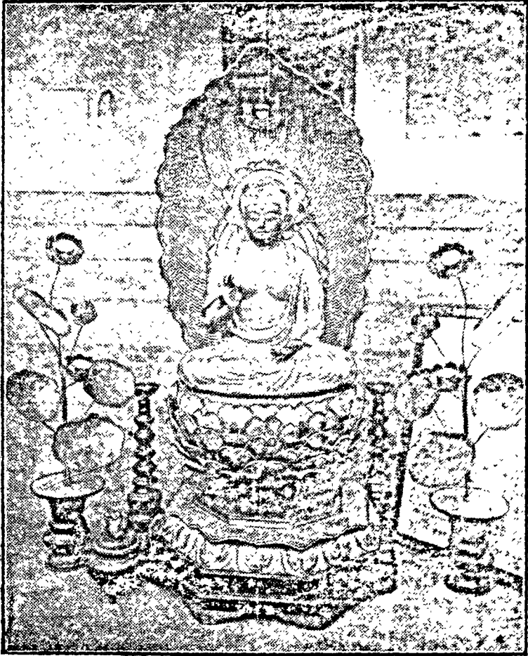
The Image of Lord Buddha brought from Japan now in possession of the Maha Bodhi Society.