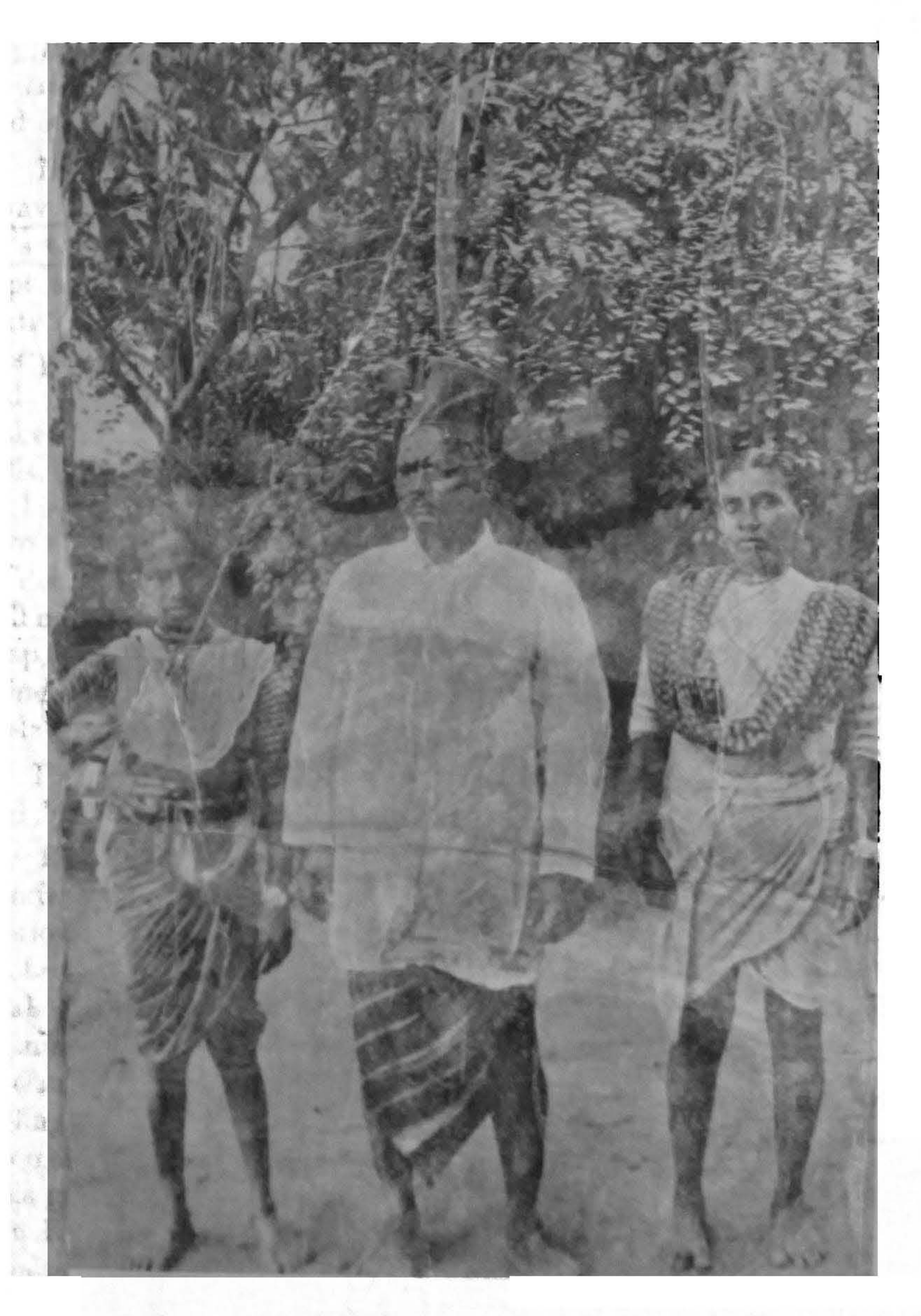
Koli sishermen of Thana.