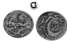
Siddiki ( 1/2 mohur )