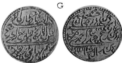
Ahmadi ( gold mohur )