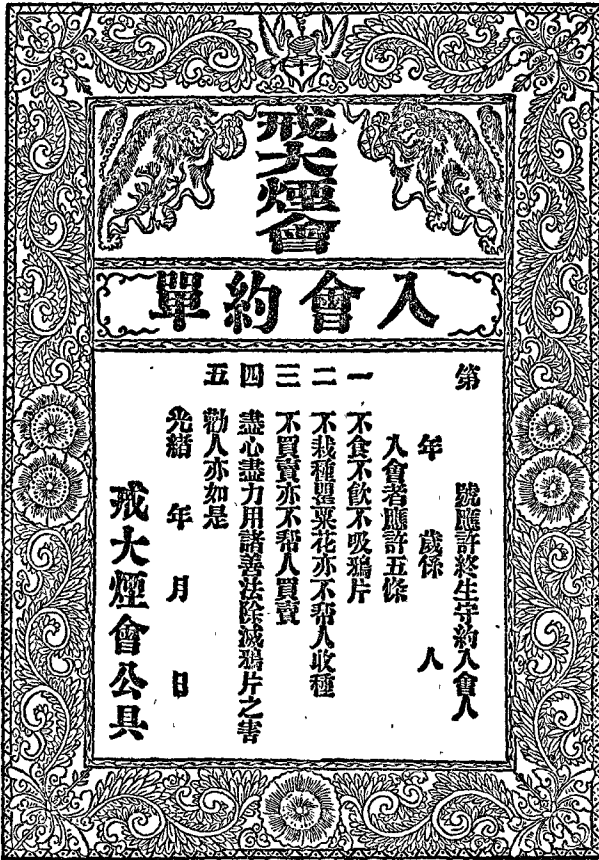
REDUCED FAC-SIMILE OF THE PEKIN ANTI-OPIMUM PLEDGE.

in China should be as the voice of God to their brethren in Great Britain, that while they send the Gospel, they will insist upon the poisonous deluge of British opium being stopped at its Indian source. Let not the streams of salvation and damnation, of blessing and cursing,