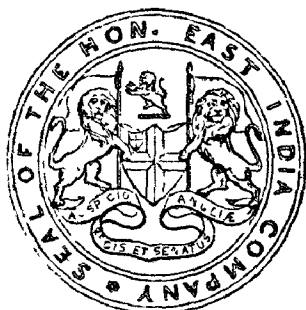
SEAL OF THE HON. EAST INDIA COMPANY.