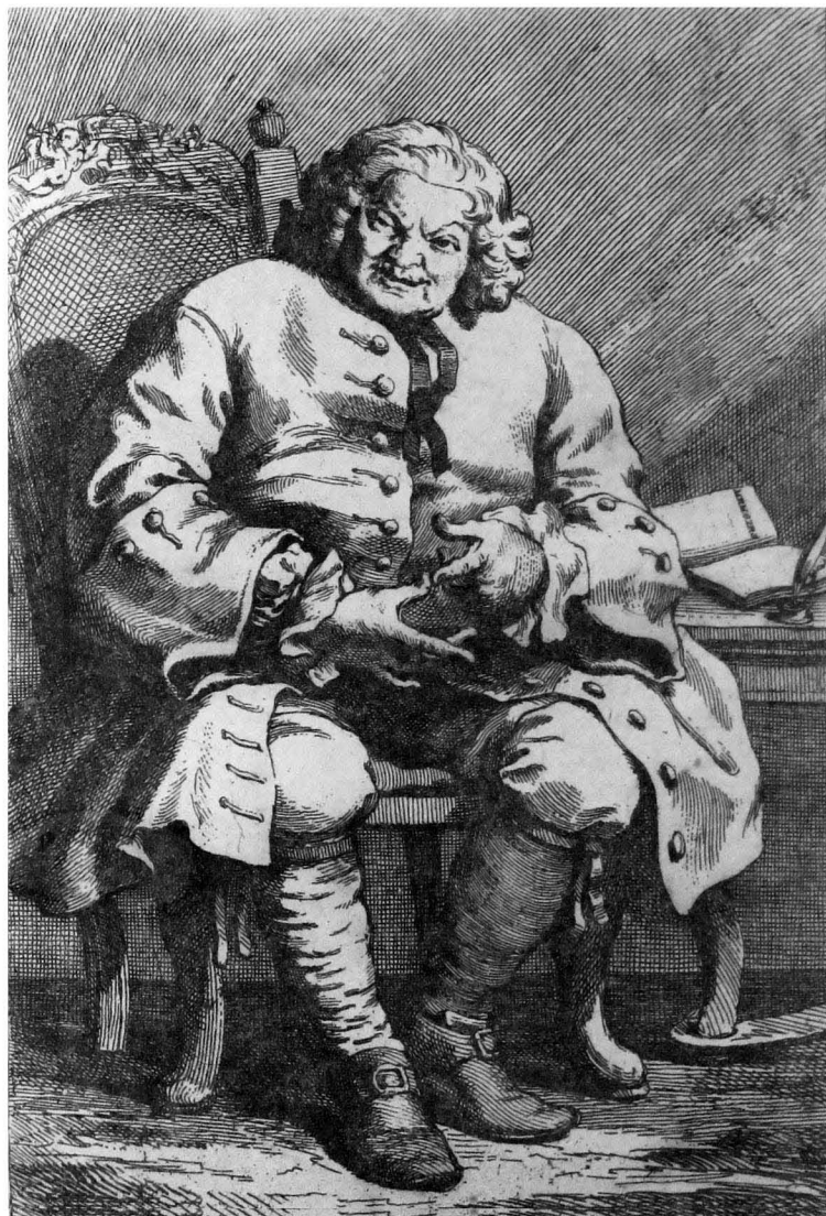
Simon, Lord Lovat, Drawn from the life and etched in Aquafortis by Will m Hogarth. Published according to the Act of Parliament, August 25 th 1757.