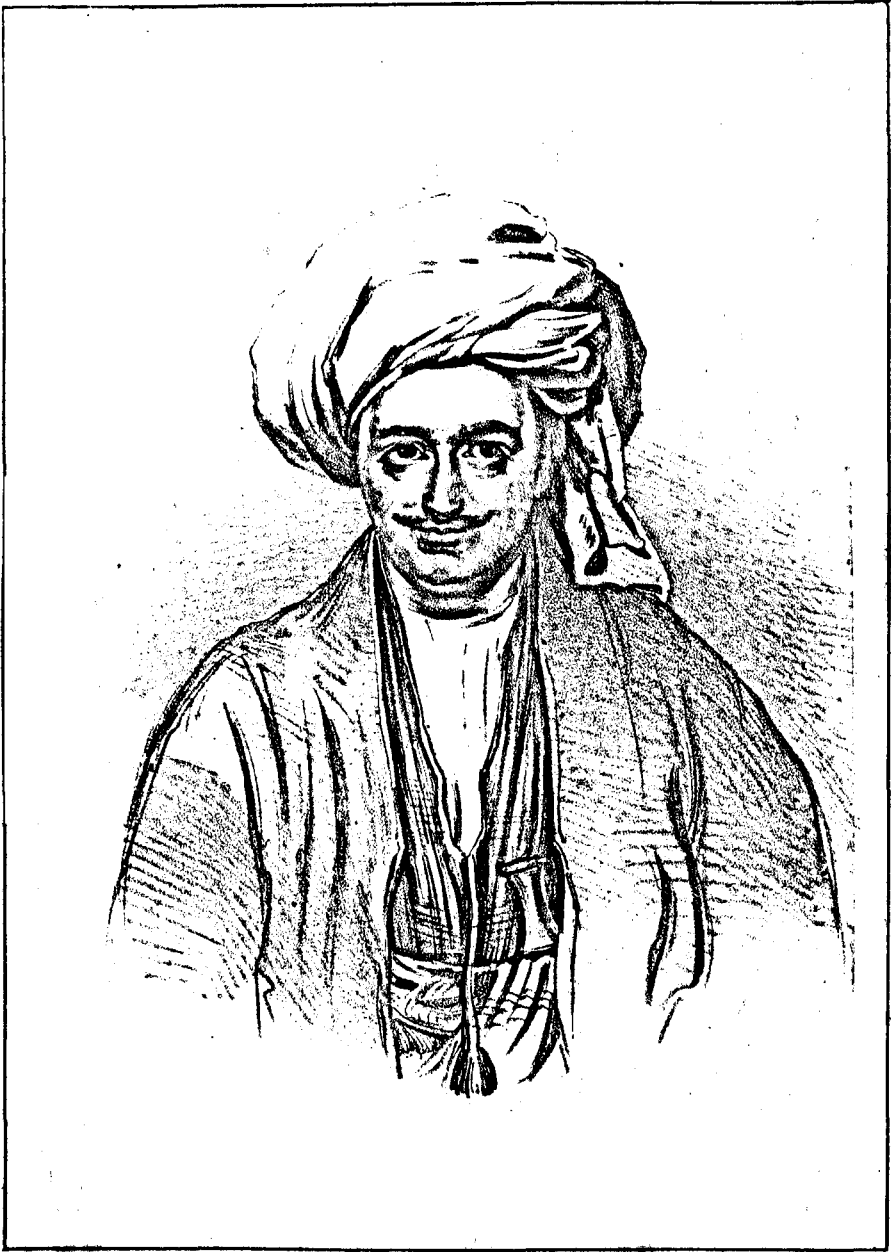
THE LATE SIR ALEXANDER BURNES KT. C.B.