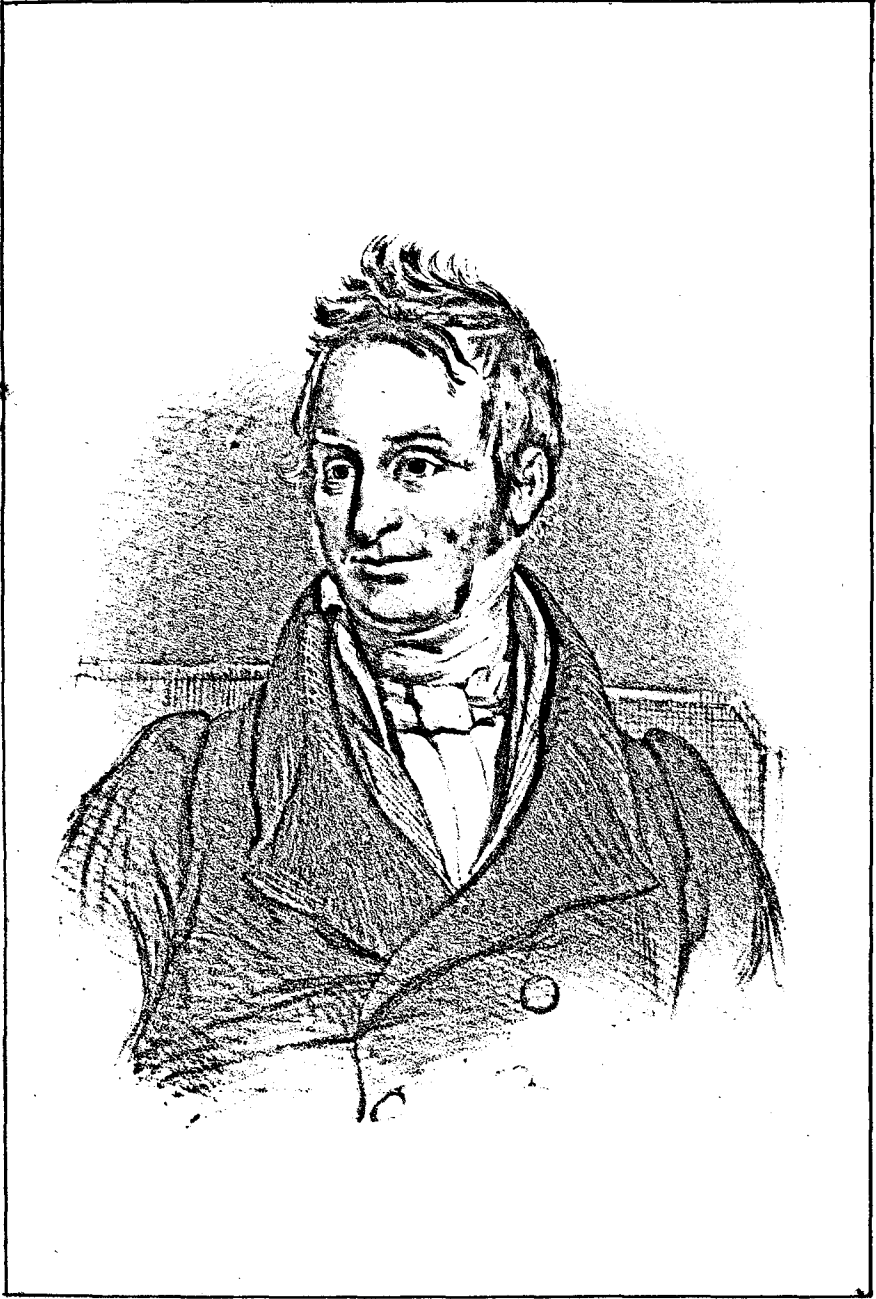
HON. MOUNT STUART ELPHINSTONE.