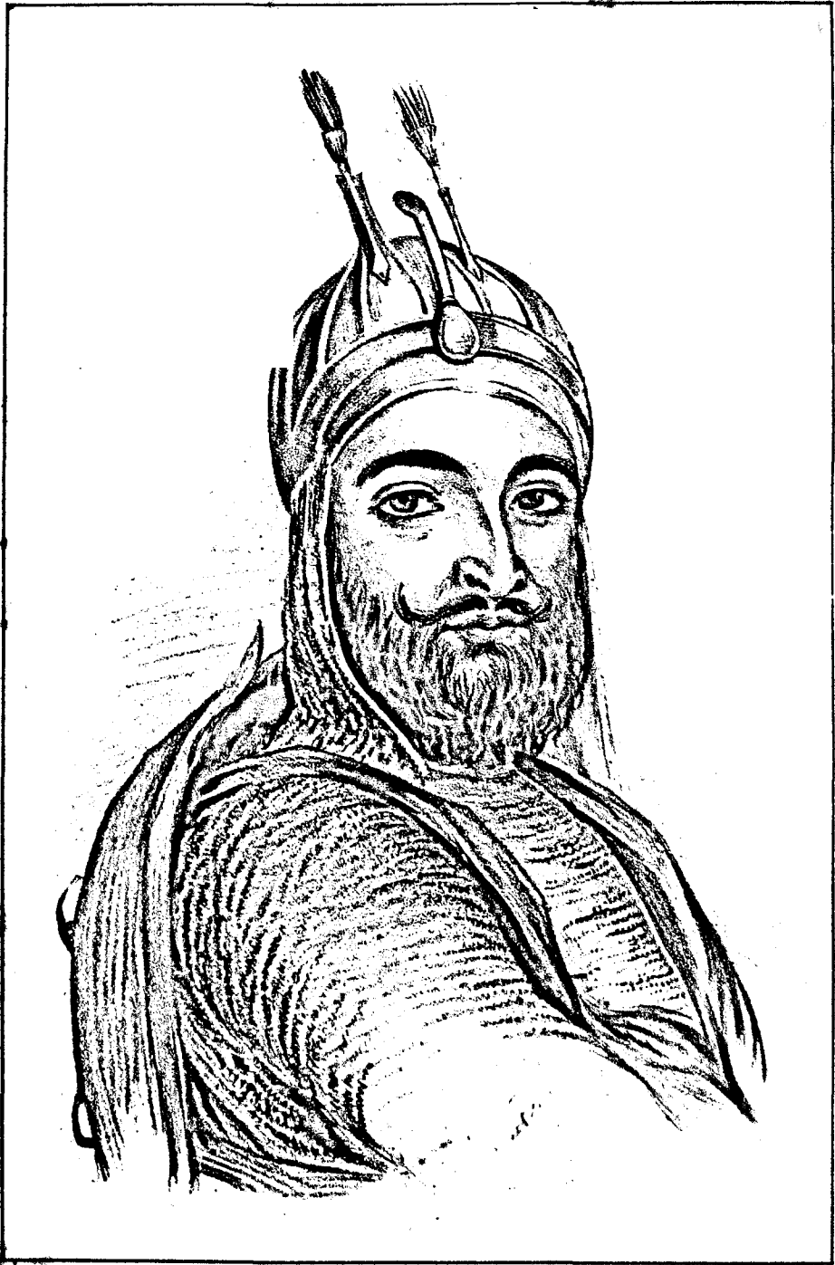
SARDAR MAHOMED AKBER KHAN.