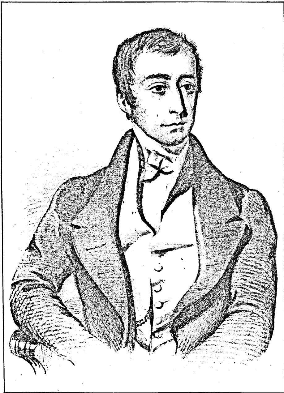
EARL OF AUCKLAND G.C.B.