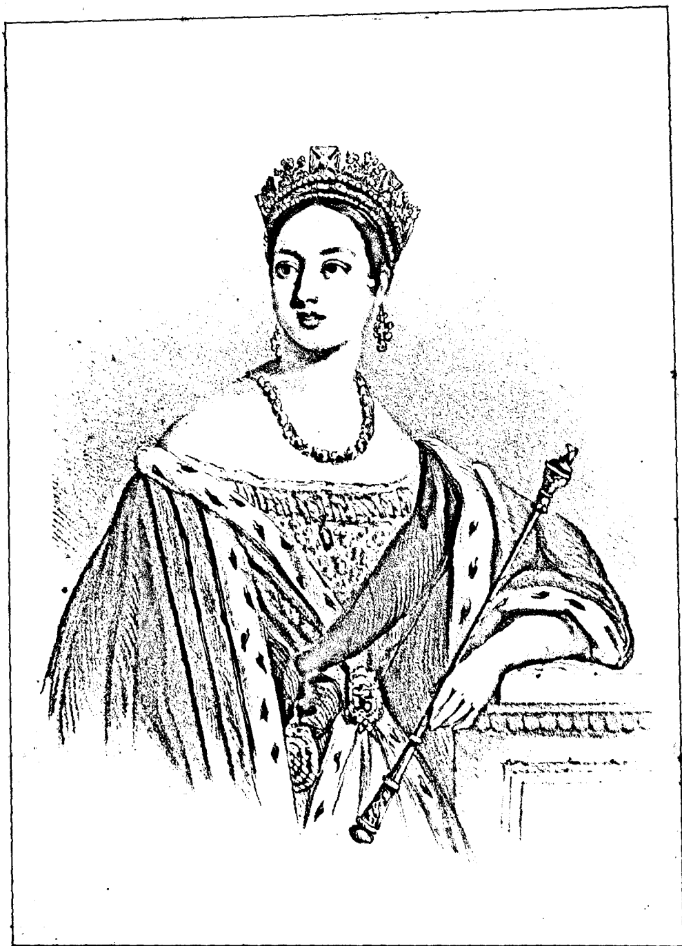
HER MOST GRACIOUS MAJESTY QUEEN VICTORIA.