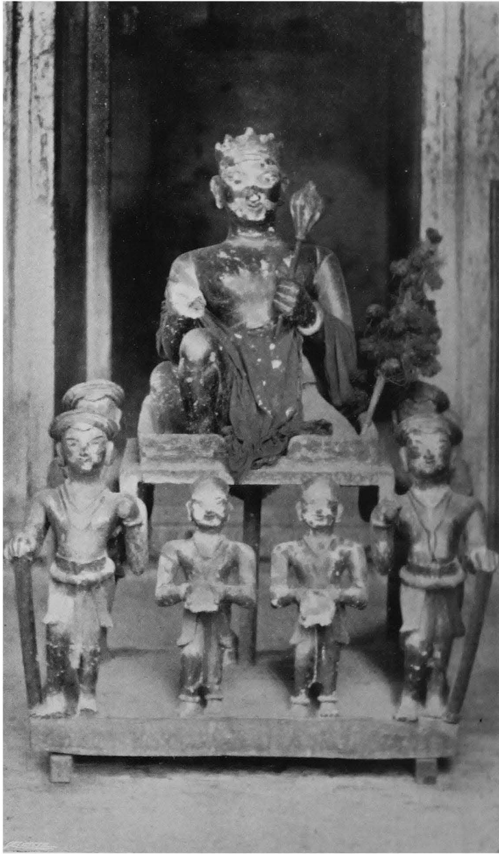
YAMA, GOD OF DEATH, BORNE BY HIS MESSENGERS.