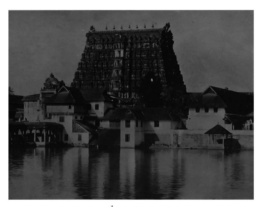
Anantapadmanabhpuram Temple at Trivandrum