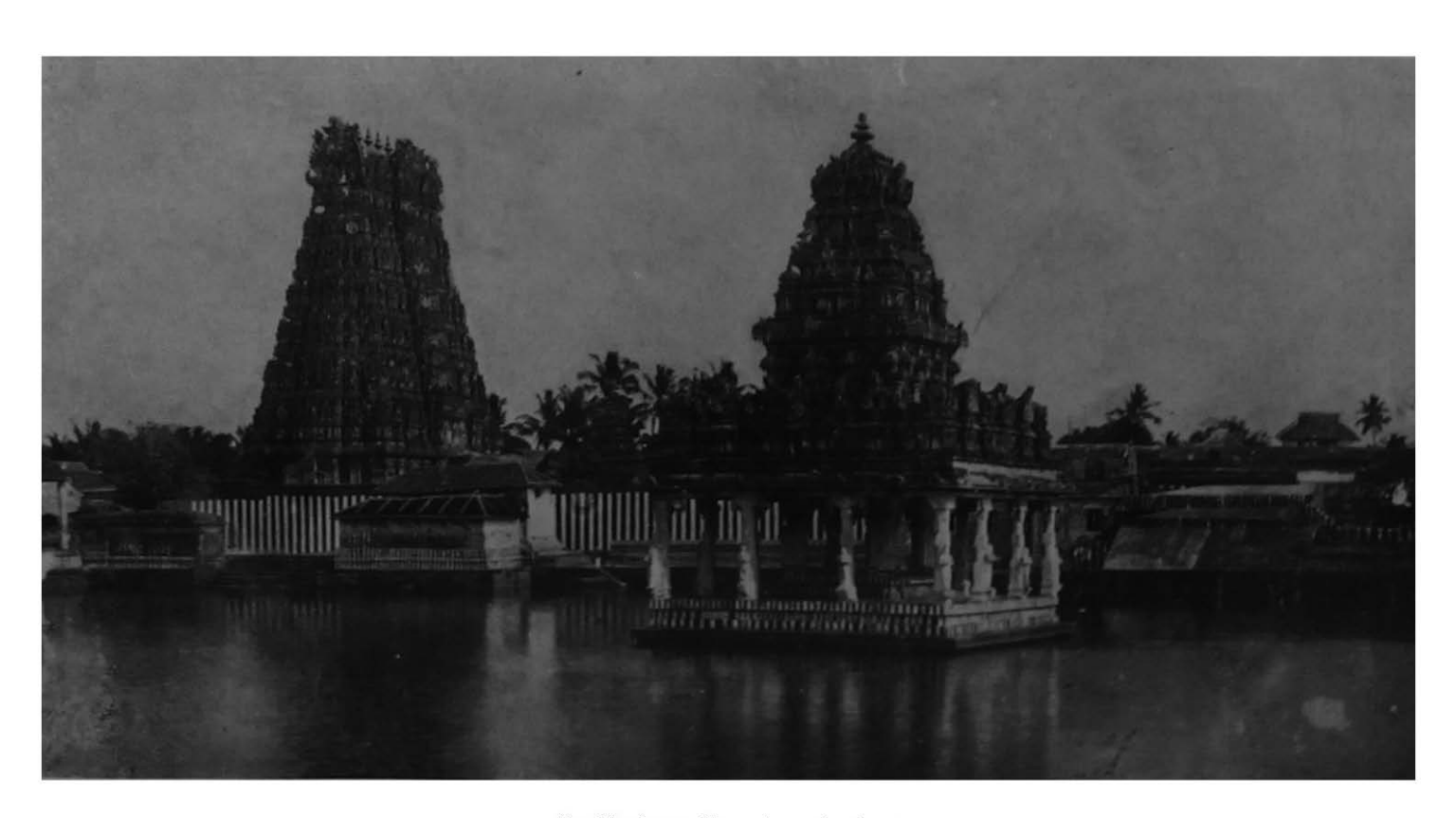
Suchindram Temple with Tank