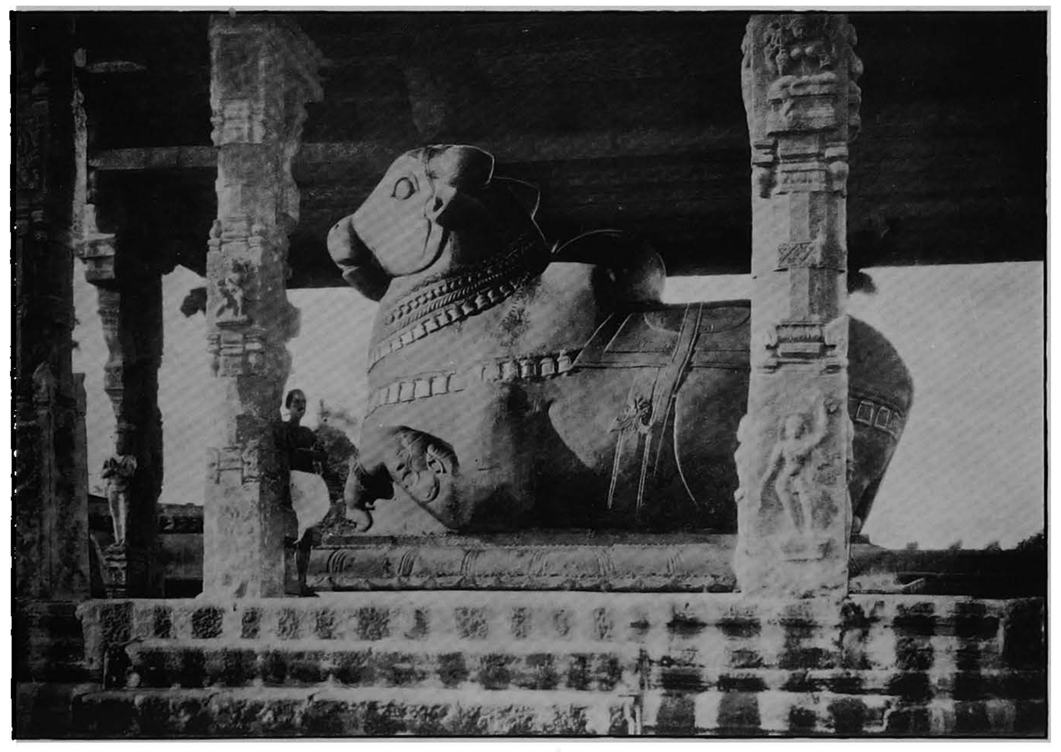
EMBLEM OF THE BULL FLOCK