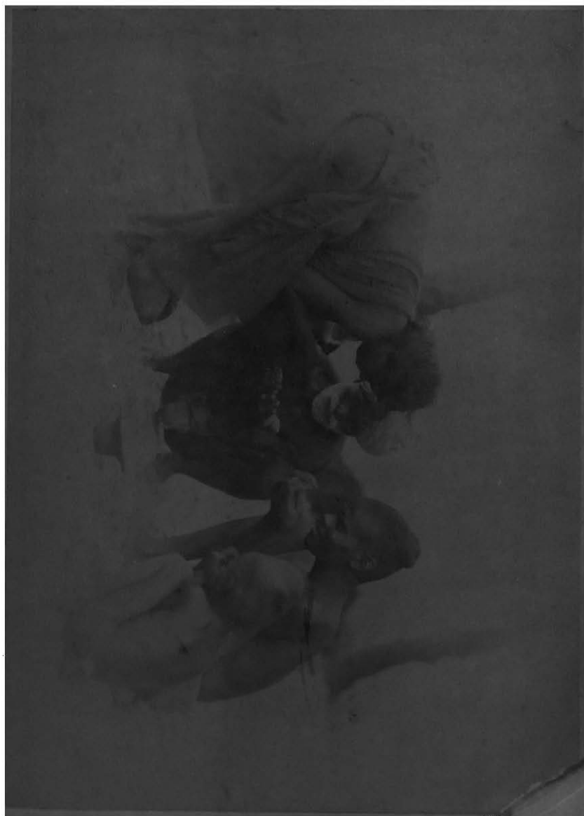
PARIAH TAKING HIS M