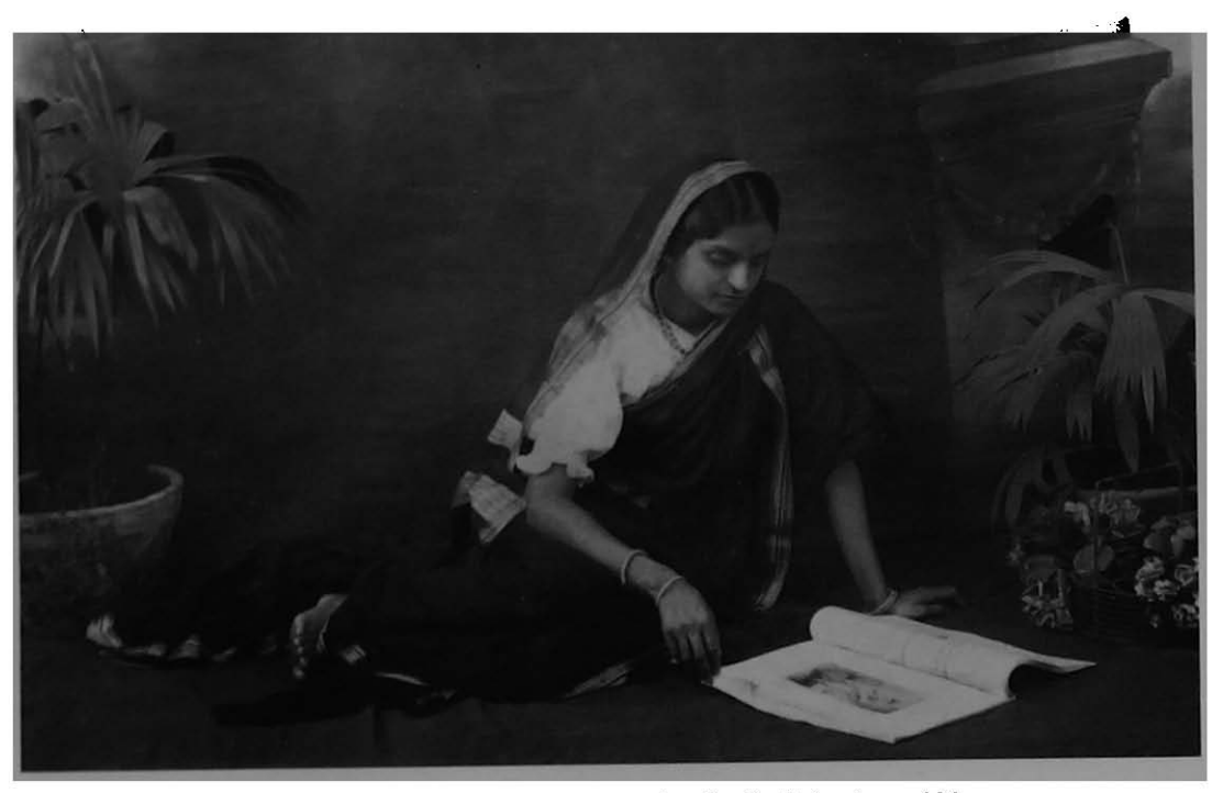
A STUDENT, typical of the class who but for St. Helena's would have been married and secluded in infancy