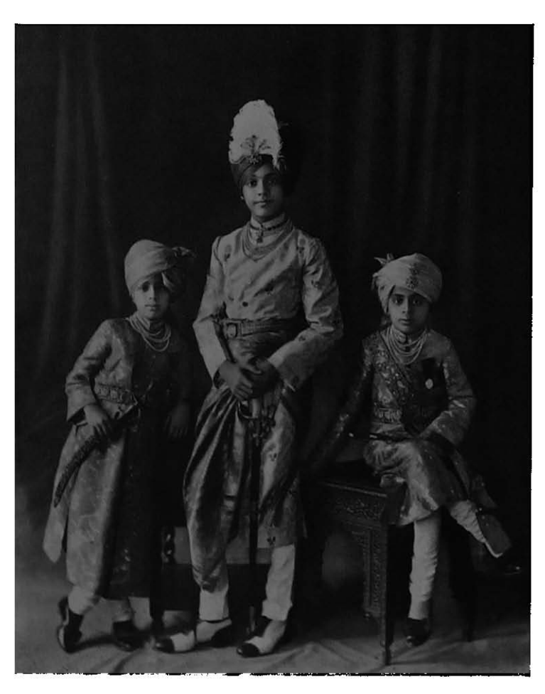
A GROUP OF ST. HELENA'S PUPILS They belong to Raj Estates, and will sit on the godi on attaining majority