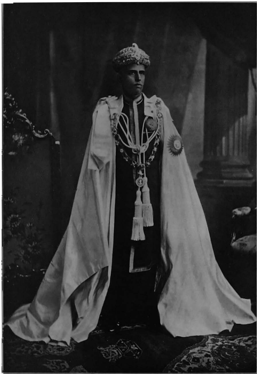
HIS HIGHNESS THE MAHARAJA OF COCHIN.