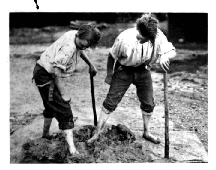
MIXING THE CLAY. A PRIMITIVE METHOD