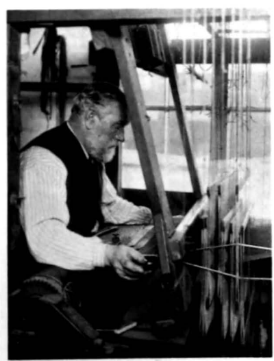
WEAVERS AT WORK