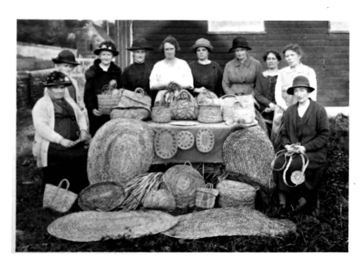
SEDGE WORKERS AND THEIR PRODUCTS