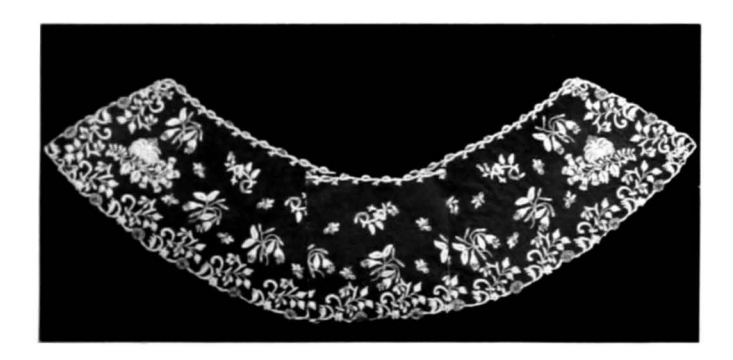
HONITON LACE Reproduced by kind permission of the Curators of the Victoria and Albert Museum