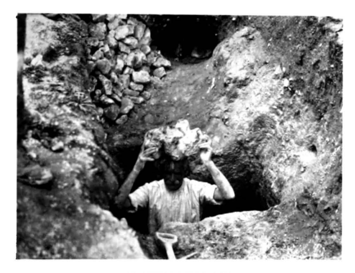
QUARRYING THE FLINTS