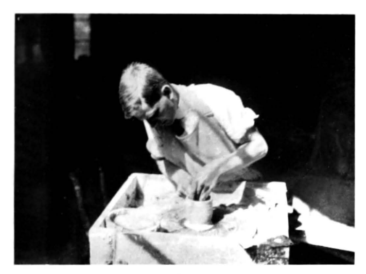
THE POTTER'S WHEEL