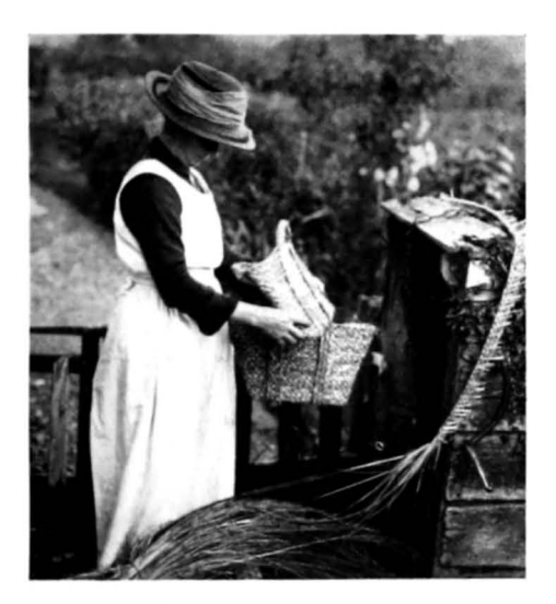
PLAITING RUSH BASKETS