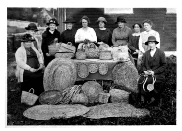
SEDGE WORKERS AND THEIR PRODUCTS