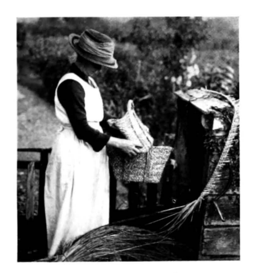
PLAITING RUSH BASKETS