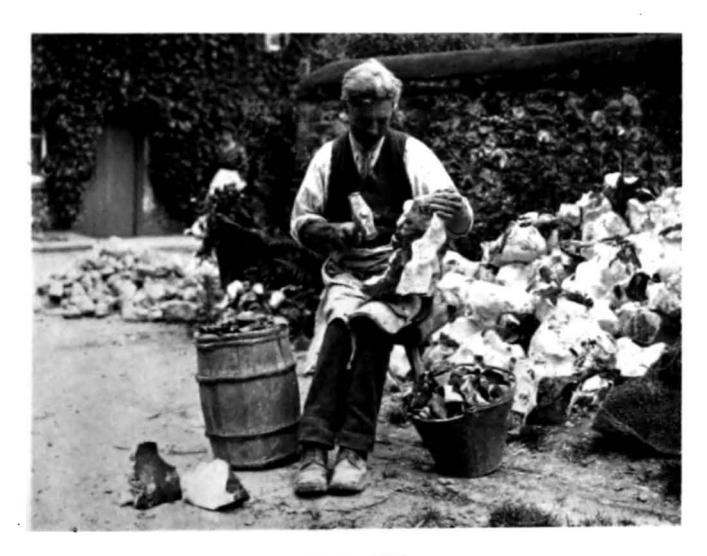
QUARTERING FLINT KNAPPING