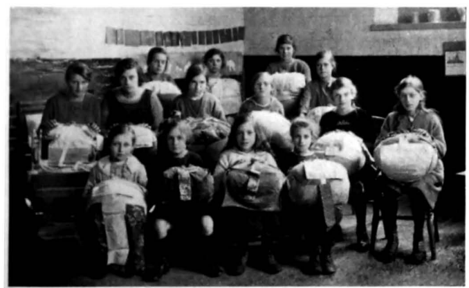
LACE MAKERS OLD AND YOUNG