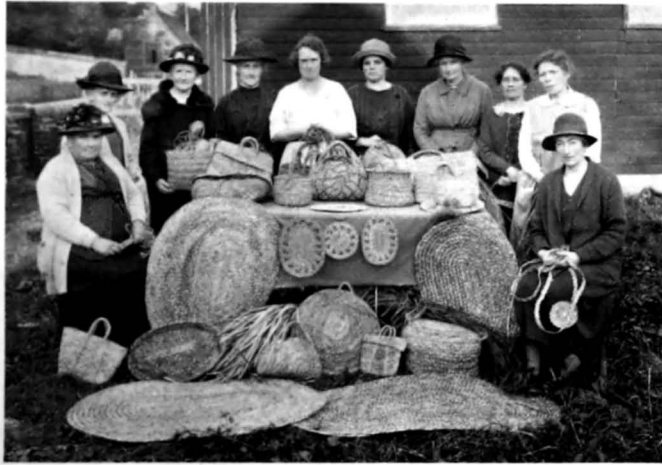
SEDGE WORKERS AND THEIR PRODUCTS