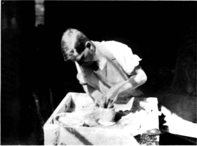
THE POTTER'S WHEEL