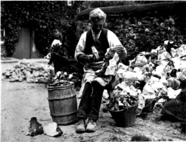
QUARTERING FLINT KNAPPING