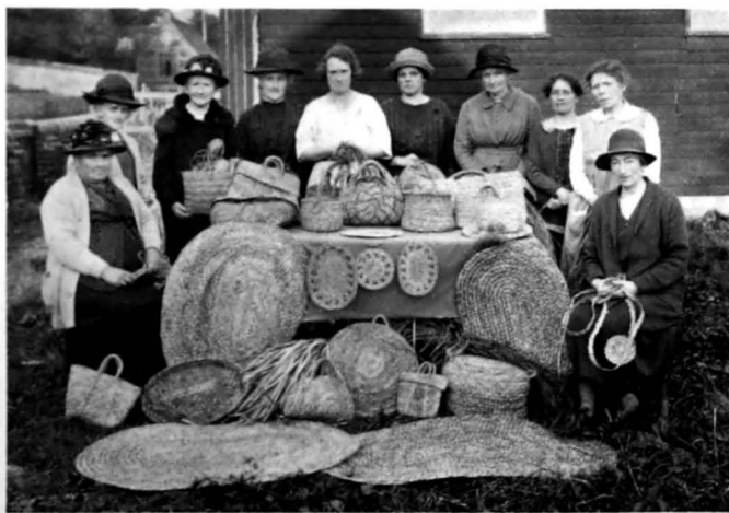
SEdge WORKERS AND THEIR PRODUCTS