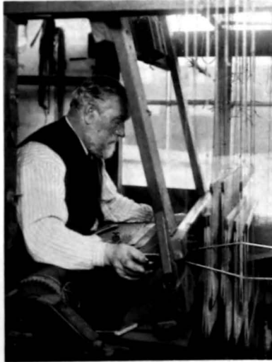
WEAVERS AT WORK