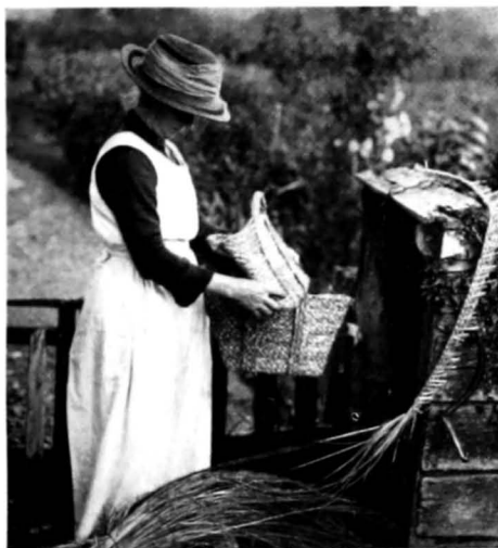
PLAITING RUSH BASKETS