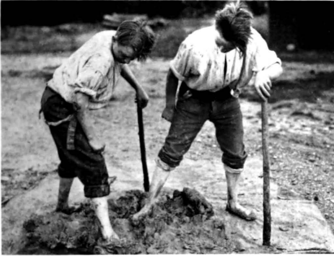
MIXING THE CLAY. A PRIMITIVE METHOD