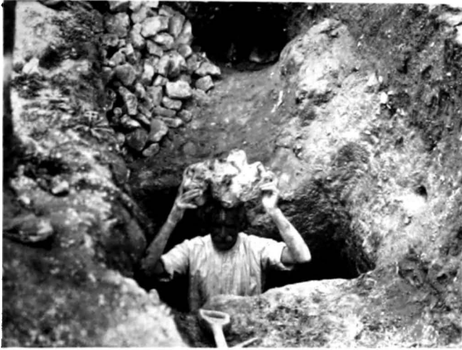
QUARRYING THE FLINTS