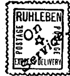
POSTAGE STAMPS ISSUED AT RUHLEBEN PRISON CAMP, USED BY PRISONERS WRITING TO EACH OTHER IN THE CAMP