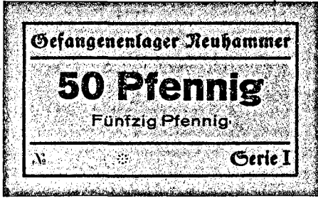
PAPER MONEY USED IN PRISON CAMPS