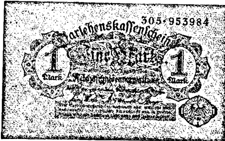
PAPER MONEY ISSUED AGAINST PROPERTY IN GERMANY. REALLY A "GREENBACK," OR ALMOST FIAT MONEY