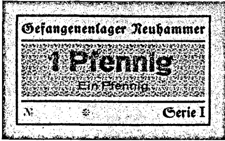
FACSIMILE OF A PRISON CAMP MONEY CERTIFICATE ISSUED AT THE PRISON CAMP OF NEUHAMMER