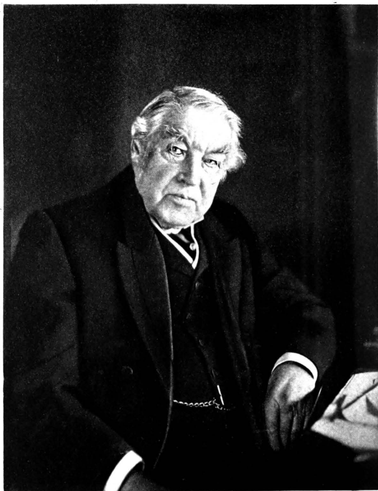
THE RT. HON. SIR CHARLES TUPPER, BART. P.C., K.C.M.G.