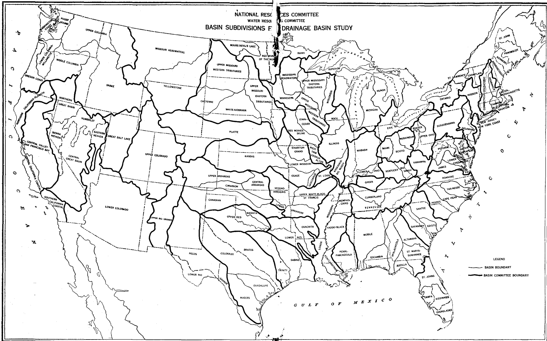
Drainage Basin Committee, with State and Federal representatives, prepared recommendations for these basins.