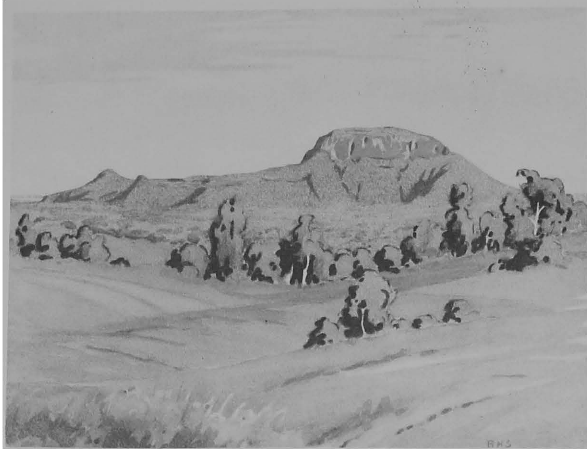
Rāmgarh Hill, Surguja State, C. P.

Reproduced by three colour offset from deep-etched plates.